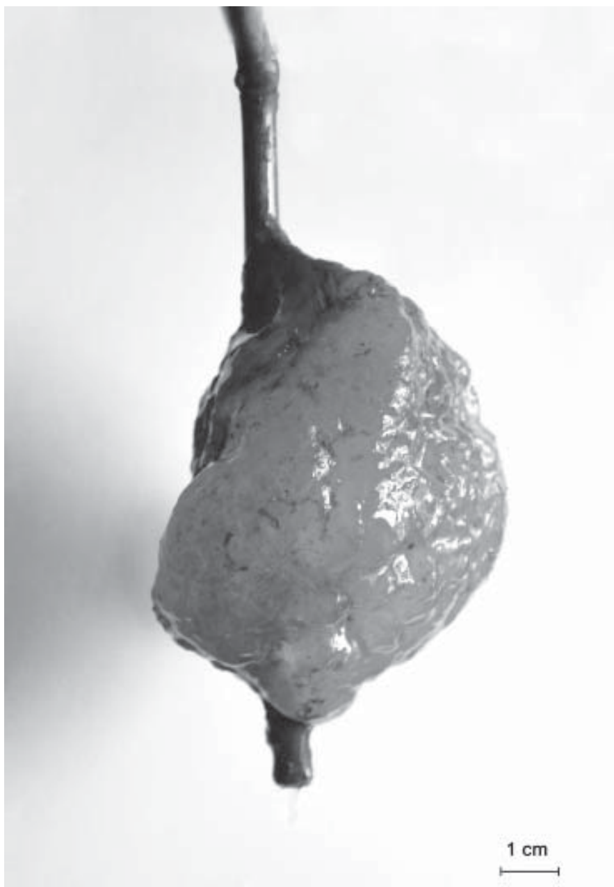
Fig. 3. General view of the colony of bryozoan Pectinatella magnifica on the reed stem from the Ukrainian part of the Danube Delta.

Kluge (1949), wrote that members of the genus Pectinatella had not been found in the USSR. However, at that time the bryozoans had not been well studied. Nevertheless, it is expected that P. magnifica would have been detected at that time and so was probably absent although it was known to be widely spread in Western Europe and North America (Kluge, 1949). Kluge (1949) predicted that this species would be found in the southern part of the USSR. This type of statoblasts is large, up to 1 mm or more in diameter, the rounded shape, with the wide swimming ring, with 10 to 20 anchors shaped hooks, that are located in one flatness and are slightly flattened, going from the edge of the ring. Studied the anatomy of