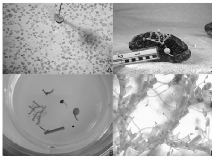
Fig.1. Camptoplites bicornis A – bottom of Clarion Clipperton, Б – manganese concretion with the colony on it, B – the colony in Petri dish, Г – the colony

High frequency climatic fluctuations of different nature heterodyne with long-term climate changes. Modern science has data about the faunal composition for the last 170–180 years maximum. There were essential changes in species composition of the fauna of different regions of the World Ocean, which have been traced by numerous expeditions. This testifies that any short-term changes and fluctuations in the hydrosphere of the Earth reflected at once on the composition and a distribution of living organisms. It is probable, that deep Antarctic currents which had penetrated to more Northern depths earlier, could influence of Arctic species diversity to a larger extent.