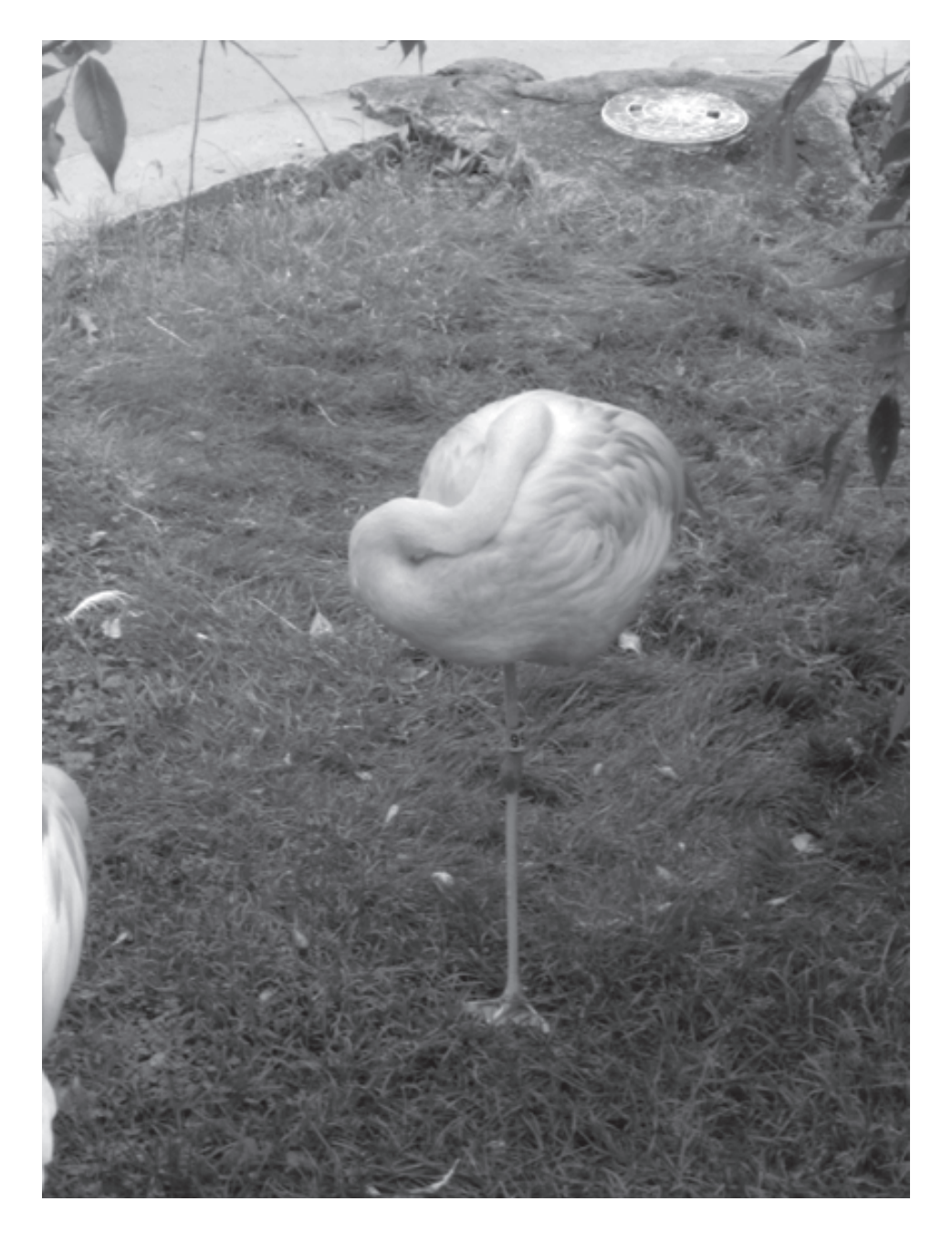
Figure 1. Resting Chilean flamingo (Study 1).