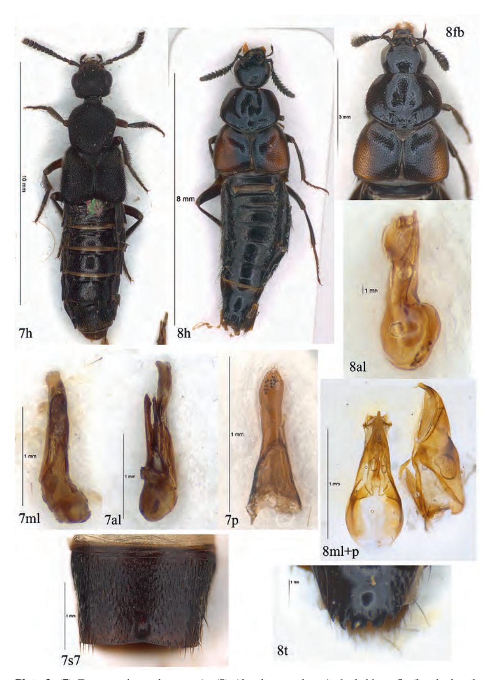
Plate 3 : (7) Tympanophorus borneensis ; (8) Aleochara muluensis ; h: habitus; fb: fore-body; al: aedoeagus in lateral view; ml: median lobe in ventral view; p: paramere; s7: male sternite VII; t: male tergite VIII.