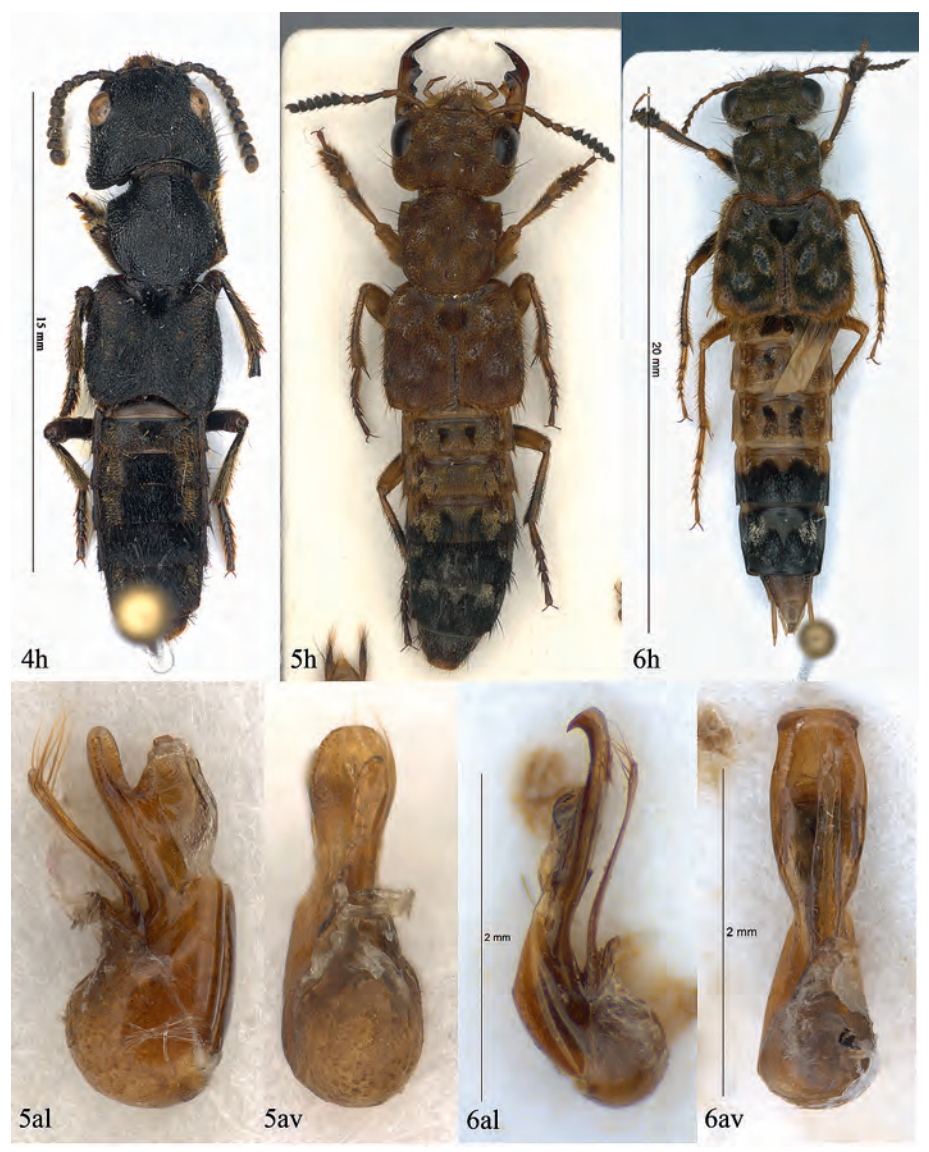
Plate 2: (4) Naddia barclayi; (5) Ontholestes lowi; (6) Ontholestes superbus; h: habitus, al: aedoeagus in lateral view; av: aedoeagus in ventral view.

E r r a t u m: in the key to the Naddia of Borneo in ROUGEMONT 2014 the line at the bottom of page 1740 ("Elytra black or fuscous, sometimes slightly rufescent...") should lead to dichotomy 7, not 11 as printed.