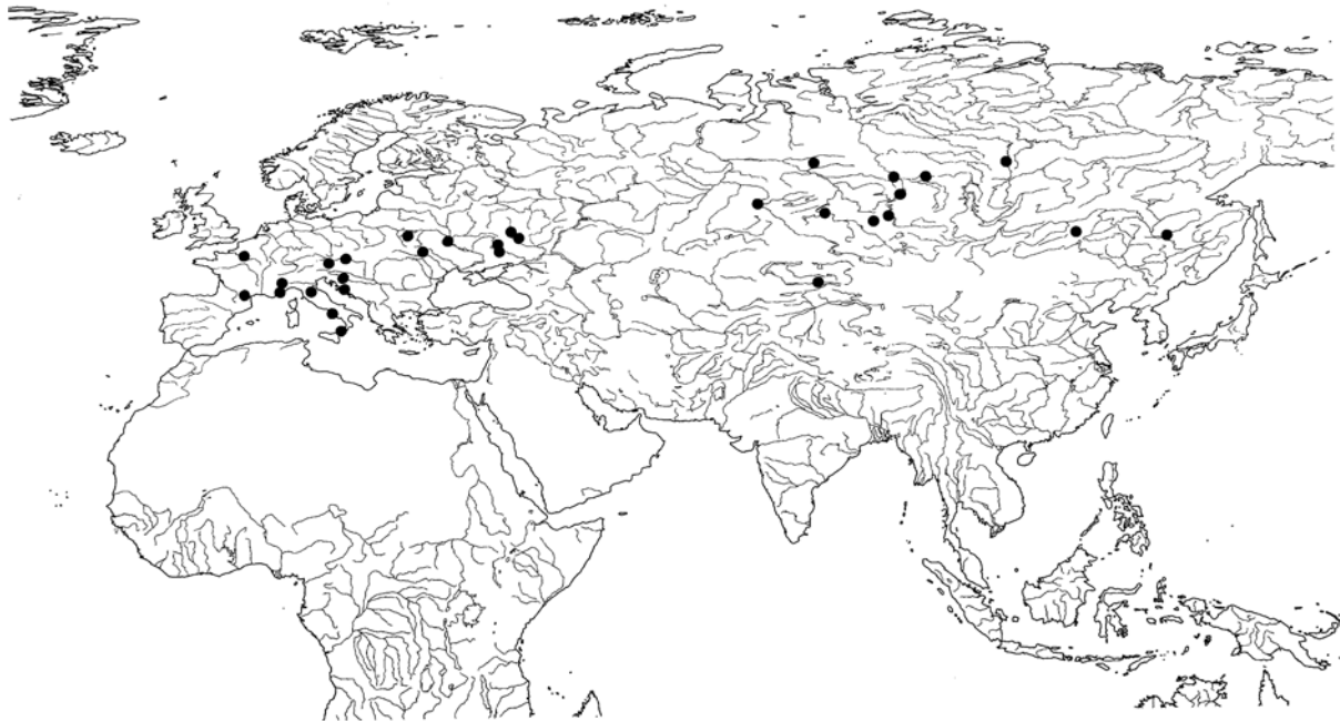
Fig. 2. Localities, where Lilioceris lili (Scopoli, 1763) was found before 1898. Рис. 2. Местонахождения Lilioceris lili (Scopoli, 1763) до 1898 года.

24.10.2011, photo by Matt. JERSEY (flickr): Saint Mary, 3.05.2009, photo by Ch. Morgan, St. Helier, Fern Valley, 23.04.2011, photo by S. Robson.