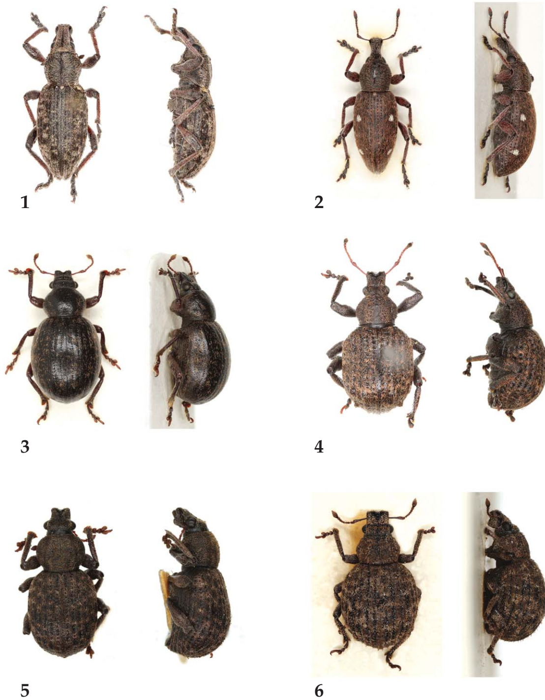
Plate 1. Entiminae. 1. Trichalophus maklini ; 2. Trichalophus rubripes ; 3. Dactylotus (Dactylotinus) globosus ; 4. Dactylotus (Dactylotinus) koreanus ; 5. Dactylotus (Dactylotinus) orientalis ; 6. Dactylotus (Nipponoblosyrus) falcatus .