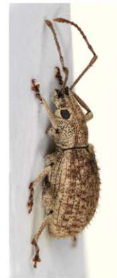
Plate 2. Entiminae. 7. Catapionus fossulatus ; 8. Catapionus modestus ; 9. Catapionus obscurus ; 10. Calomycterus setarius ; 11. Cyrtepestomus castaneus ; 13. Ptochidius tessellatus .