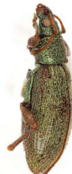
Plate 6. Entiminae. 32. Aspalmus japonicus ; 33. Phyllobius ( Diallobius ) incomptus ; 34. Phyllobius ( Odontophyllobius ) armatus ; 35. Phyllobius ( Otophyllobius ) prolongatus ; 36. Phyllobius ( Otophyllobius ) rotundicollis ; 37. Phyllobius ( Phyllobius ) intrusus .