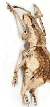
Plate 5. Entiminae. 26. Nothomylocerus illitus ; 27. Phyllolytus psittacinus ; 28. Phyllolytus variabilis ; 29. Pseudoedophrys hilleri ; 30. Dermatoxenus caesicollis ; 31. Episomus turritus .