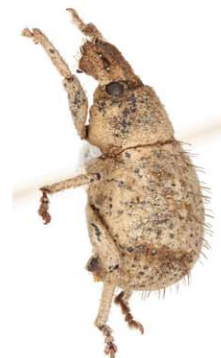
Plate 11. Entiminae.; 67. Meotiorhynchus querendus ; 68. Scepticus griseus ; 69. Scepticus insularis ; 70. Scepticus sungboggi ; 71. Scepticus uniformis ; 72. Pseudocneorhinus adamsi .