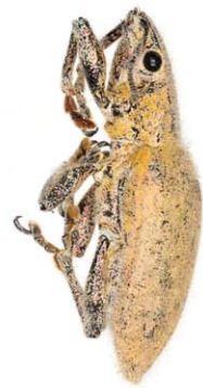
Plate 8. Entiminae. 46. Sitona japonicus ; 47. Sitona lineatus ; 48. Sitona lineellus ; 49. Sitona obsoletus obsoletus ; 50. Sitona ovipennis ; 53. Hypomeces squamosus .