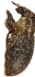
Plate 7. Entiminae. 38. Phyllobius ( Phyllobius ) subnudus ; 39. Polydrusus ( Caenotylodrosus ) obesulus ; 42. Eugnathus distinctus ; 43. Sitona aberrans ; 44. Sitona amurensis ; 45. Sitona hispidulus .