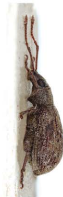
Plate 4. Entiminae. 20. Lepidepistomodes kokurohoshi ; 21. Lepidepistomodes nigromaculatus ; 22. Lepidepistomus elegantulus ; 23. Myosides chejuensis ; 24. Myosides seriehispidus ; 25. Nothomylocerus griseus .