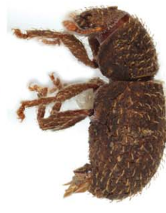
Plate 12. Entiminae. 73. Pseudocneorhinus bifasciatus ; 74. Pseudocneorhinus minimus ; 75. Pseudocneorhinus obesus ; 76. Pseudocneorhinus setosus ; 77. Pseudocneorhinus soheuksandoensis ; 78. Trachyphloeosoma advena .