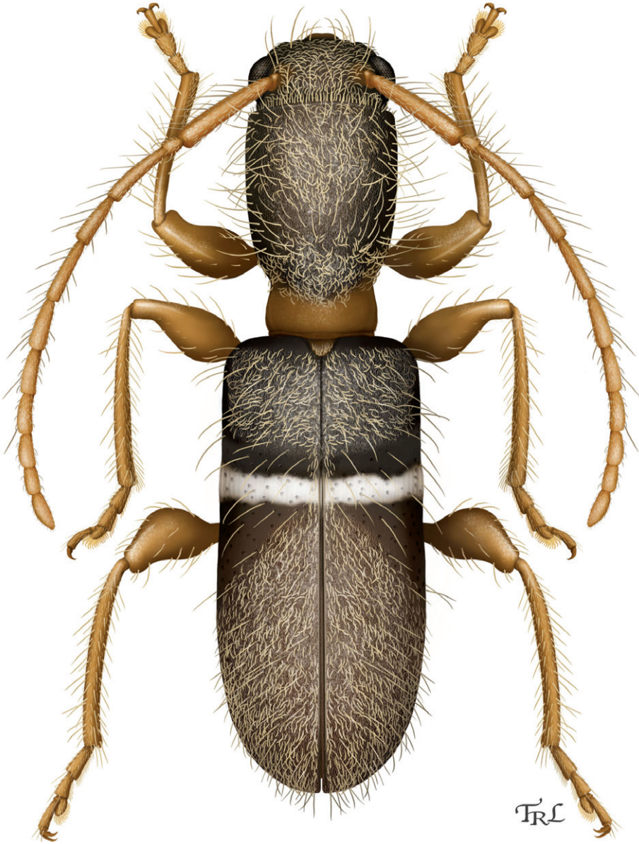
Figure 5. Tilloclytus neiba sp. n., dorsal habitus. Digital painting by Taina Litwak.