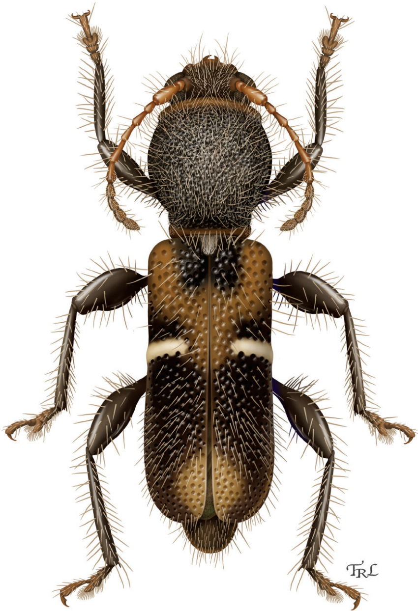
Figure 3. Callichytus macoris sp. n., dorsal habitus. Digital painting by Taina Litwak.