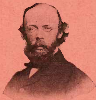
CHARLES ROBERT OSTEN SACKEN, 1828-1906