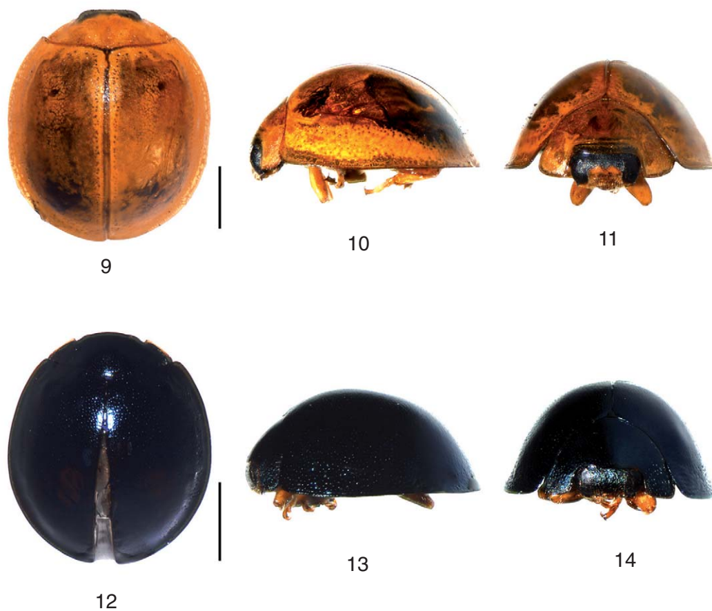
Figures 9–11 Chujochilus parisensis sp. nov. (9) dorsal view; (10) lateral view; (11) frontal view. Figs 12–14 Chujochilus sagittatus sp. nov. (12) dorsal view; (13) lateral view; (14) frontal view. Scale bars = 1 mm.

Description. TL: 2.9–3.4 mm, TW: 2.6–3.1 mm, TH: 1.3–1.6 mm, TL/TW: 1.09–1.12; PL/PW: 0.45–0.46; EL/EW: 0.87–0.93.