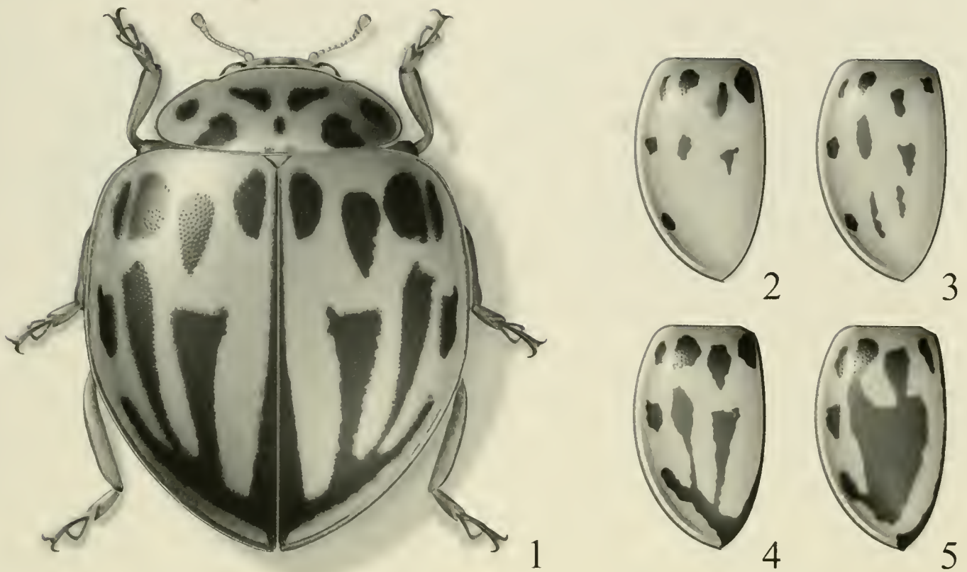
Figs. 1-5. Olla lacrimosa . 1, Habitus of Holotype (male). 2-5, Left elytron of selected individuals, showing a range of color patterns.

tification (see "other material examined," below)