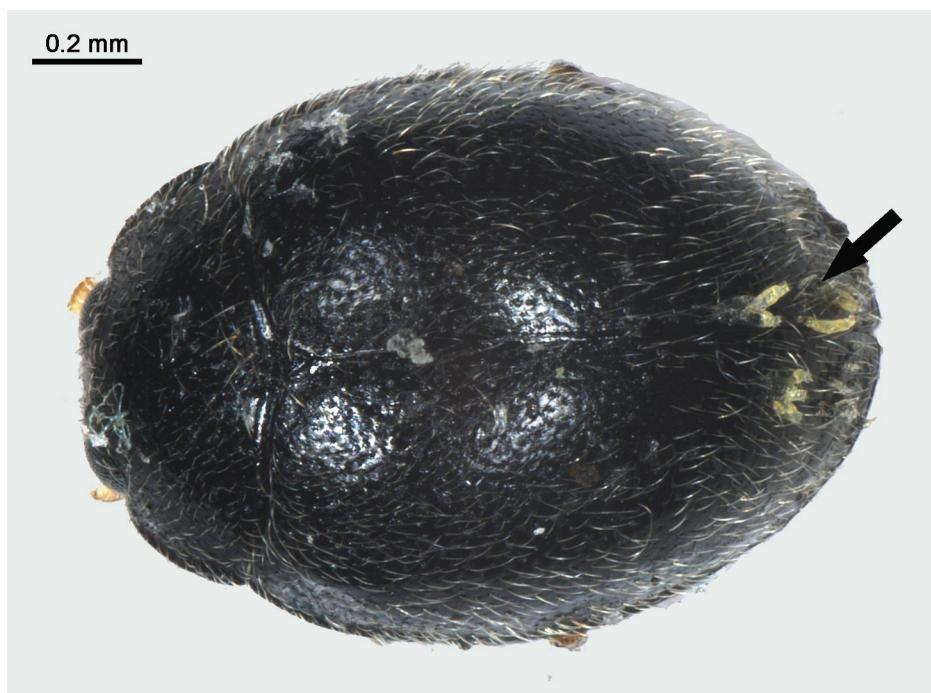
Fig. 1. Stethorus pusillus with thalli of Hesperomyces coccinelloides on its elytra. The arrow shows a group of thalli.

infected by H. coccinelloides . In each of the infected beetles the fungal thalli were situated on the elytra (Fig. 1). Four and twenty-two mature thalli were found on the two hosts in the July sample, while the infected specimen collected in September bore 11 mature thalli. As in many other Laboulbeniales, the thallus of H. coccinelloides consists of a receptacle with a melanized foot, a perithecium where ascospores are produced and an appendage bearing spermatia-producing antheridia (Fig. 2). The characteristic feature of the thallus of H. coccinelloides , a crown-like structure on the perithecial tip with four lobes reaching a similar height, is well visible on Fig. 2. In mature thalli of H. virescens , the two upper lobes are much longer than the two lower lobes (see SANTAMARIA 2003, DE KESEL 2011).