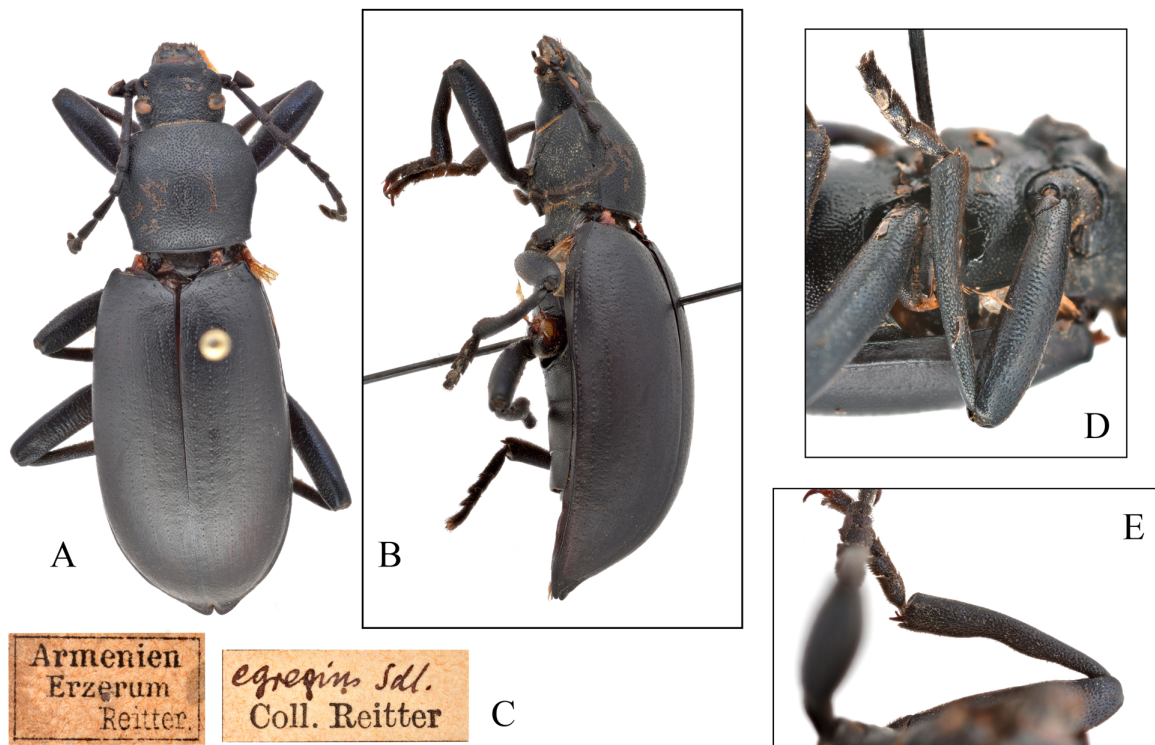
FIGURE 1. Entomogonus makovskyi ( E. egregius Seidl. sensu Reitter (1922)) from Erzurum, male. A, dorsal view; B, lateral view; C, labels of the specimen; D, left mesotibia; E, right protibia.