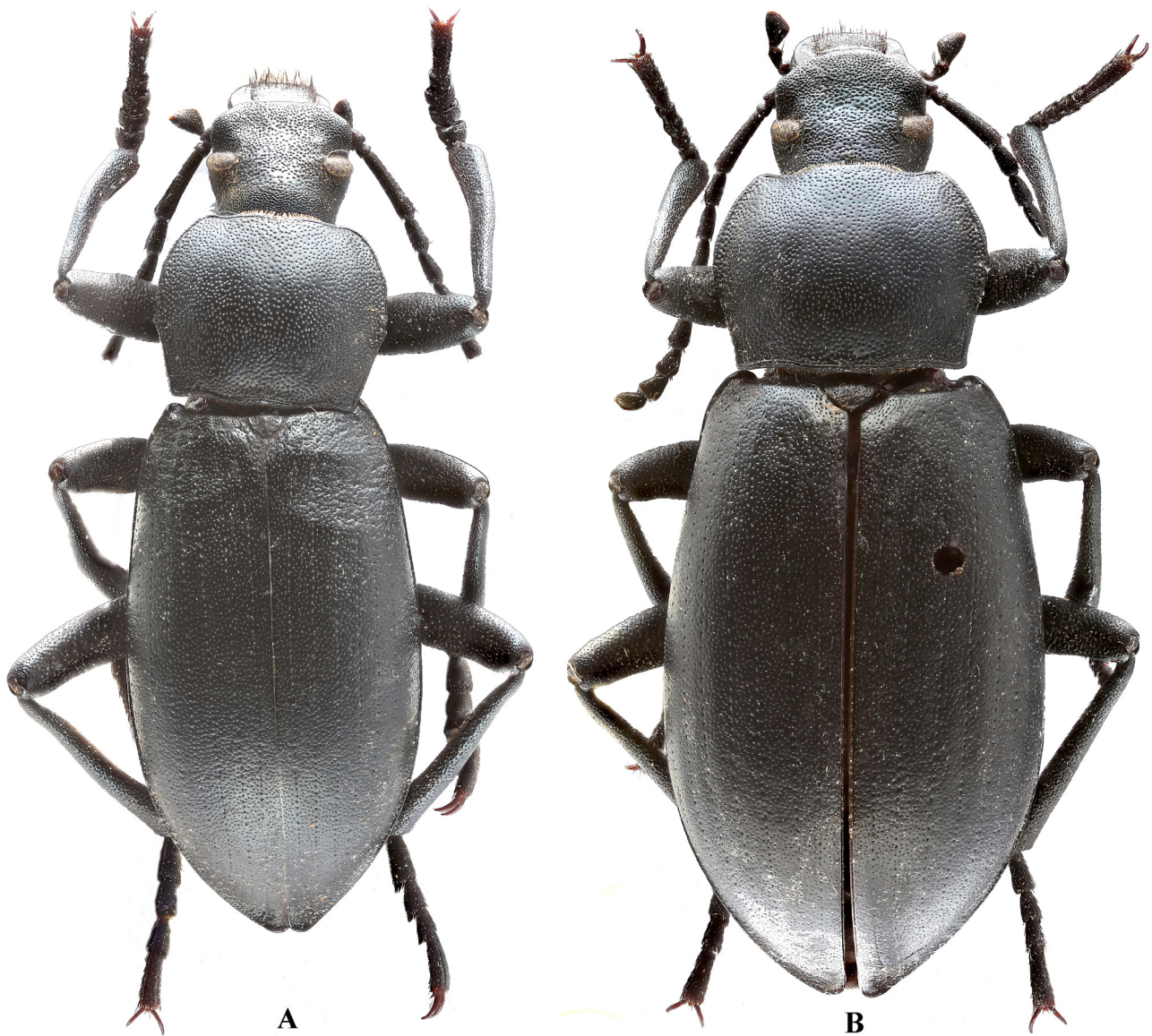
FIGURE 3. Entomogonus doguanatolicus sp. n. , habitus. A, male; B, female.

species), wider male pronotum (1.26× as wide as long in E. doguanatolicus sp. n. and 1.08× as wide as long in E. bialookii and E. makovskiyi ), non-claviform widened male protibia (claviform in E. clavimanus ), flattened apices of elytra (convex in E. bialookii and E. makovskiyi ), protruding anterior corners (not protruding in E. bialookii and E. makovskiyi ).