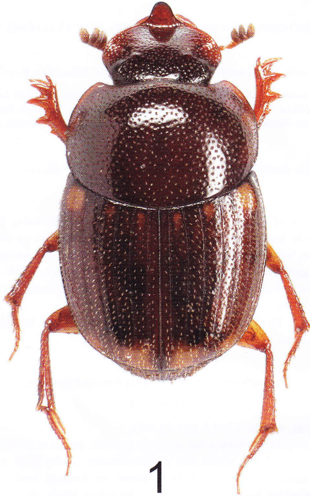
Fig. 1. Onthophagus ( Onthophagus ) koechlei sp. nov., habitus (holotype, male).

finely bordered; lateral margins gently rounded in front, nearly straight or scarcely sinuate behind, finely bordered; anterior angles distinctly produced forward, with apex rectangular or slightly obtuse; posterior angles obtuse; basal margin obtusely angled at the middle, not bordered; disc evenly and not so strongly convex dorsad, without trace of depression or tubercle; surface moderately, partly, rather sparsely covered with strong punctures, which become slightly larger laterad, with interspace between punctures smooth and polished.