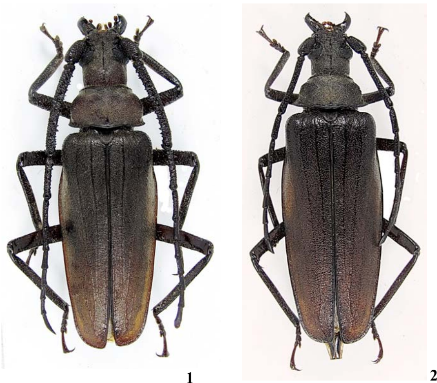
Figs. 1, 2. Aegosoma ivanovi sp. n. 1 – ♂, holotype; 2 – ♀, paratype from Primorskii krai (Merkushevka).

than body length, in females – surpassing elytral middle; relative length of antennal joint about the same as in Ae. sinicum ; sculpture of antennal surface in males much rougher than in Ae. sinicum (Figs 9 vs 11), joint 1 with rough irregular rugae, joints 3 and 4 with distinct transverse carinae and long internal spines; in females joint 1 with dense regular punctation (rugosely punctate in Ae. sinicum (Figs 10 vs 12), joints 3-5 sparsely punctate, shiny (densely irregularly punctate, dull in Ae. sinicum ). Prothorax strongly transverse, strongly widened posteriorly, usually much wider than in Ae. sinicum (in some specimens less wider than in Ae. sinicum ), in males from 1.7 to about 2.3 times shorter than basal width; in females from 2.2 to about 2.5 times shorter than basal width; lateral roughly sculptured pronotal area in male and in female much wider than in Ae. sinicum ; orange setal pronotal areas (typical for Ae. sinicum ) indistinct. Elytra with very fine indistinct pubescence, distinctly shiny, with small shining areas among fine punctation (absent in Ae. sinicum ), shiny