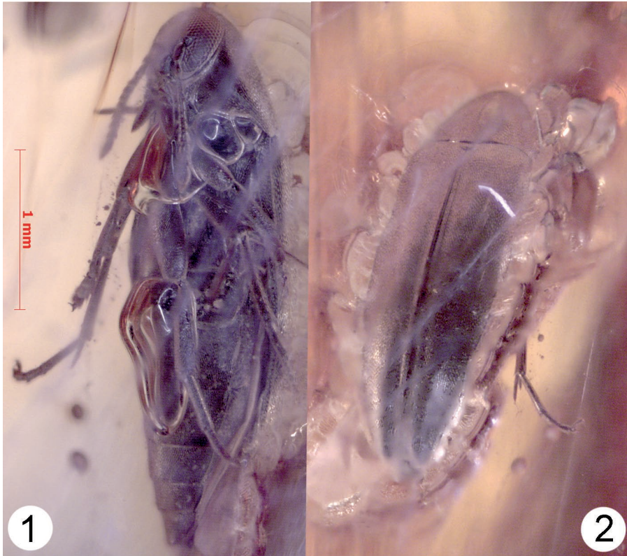
1, 2. Orchesia turkini sp. nov.: 1 – ventral view, 2 – latero-dorsal view

The new species is most similar to the recent O. (Orchestera) luteipalpis MULLSANT et GUILLEBEAU, 1857 but differs from it in possessing longer metatibial spurs (in O. luteipalpis they are 1.33-1.40 times shorter than the first metatarsomere).