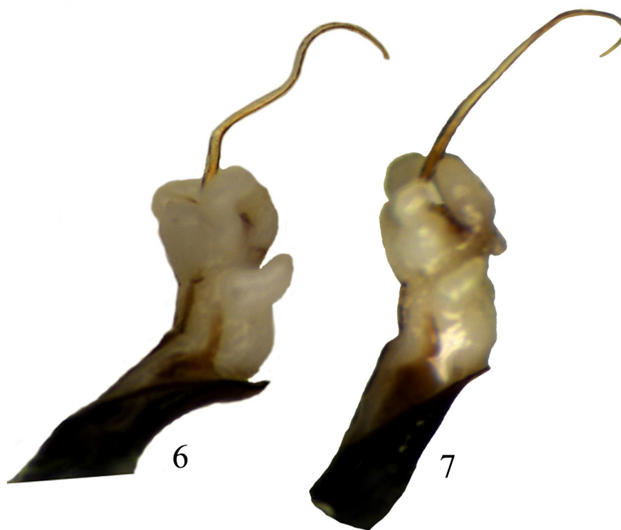
Figs. 6-7. Apex of aedeagus with inflated internal sac: 6 – Oulema erichsonii , 7 – O. septentrionis .

Recently O. septentrionis (Weise, 1880) was confirmed in Sweden, Denmark and Norway (Wanntorp 2009). In Sweden, records of O. septentrionis (Weise, 1880) were done in humid meadows while O. erichsonii (Suffrian, 1841) seems to prefer dry habitats.