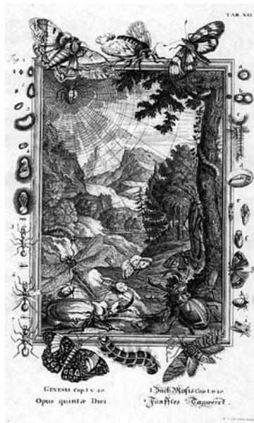
Figure 3. — Johann Jacob Scheuchzer, Physica sacra . Plate XII, 1731. Universitätsbibliothek, Basel.

The naturalist Johann Jacob Scheuchzer describes God’s creation of nature in his treatise, “ Physica Sacra ” (1731). One panel depicts all of the insect orders in a valley basin in the Alps and right up in front a stag beetle, which is very similar to the one in the “ Archetypa ” (Fig. 3). A stag beetle in a meadow in the company of other insects is the motive of a beautifully hand painted print in the “ Monatlich herausgegebenen Insectenbelustigung ” by the German August Rösel von Rosenhof (1749). This volume is one of the most treasured books of the 18th century.