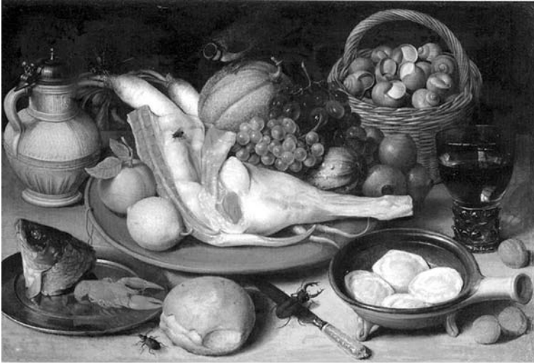
Figure 2. — Georg Flegel, Esswaren mit Käfern und Meise , 16th/17th century. Öffentliche Kunstsammlung Kunstmuseum, Basel.

About the same time, Otto Marseus van Schrieck dedicated a splendid and romantic painting to the stag beetle, on which a male and female Lucanus cervus are flying around a hazel shrub. In a further painting he portrays the beetle fighting with a wasp next to a bird's nest.