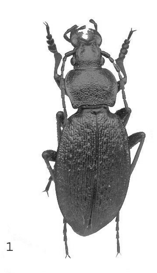
Fig. 1. Carabus (Morphocarabus) odoratus divnoensis ssp. n. (holotype, general view).

[Received September 2005. Accepted October 2005]