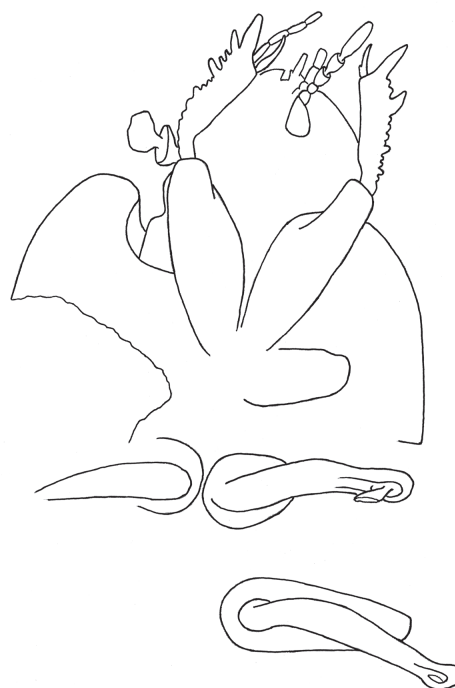
Fig. 2. Libanochrus calvus gen. et sp. nov., holotype. Head and thorax, ventral view. Head width 2.6 mm.

(being evidence of the traces of moving in the amber), then it was destroyed and decayed before fossilization (as a result its remains including appendages became additionally depressed).