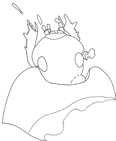
Fig. 1. Libanochrus calvus gen. et sp. nov., holotype. Head and pronotum, dorsal view. Head width 2.6 mm.