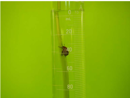
Fig. 3. Submerged adult Colorado potato beetle walking up a wooden rod underwater in a graduated cylinder.

males and females ( F(1,24) = 0.00 ; P = 0.963 ), and there were no interactions ( F(1,24) = 1.37 ; P = 0.253 ). There were no significant differences in the frequency of clockwise ( F(3,24) = 0.67 ; P = 0.579 ) or counter-clockwise ( F(3,24) = 0.52 ; P = 0.674 ) 360° rotations. The mean number of clockwise rotations was similar between arenas with and without driftwood ( F(1,24) = 0.06 ; P = 0.802 ), males and females ( F(1,24) = 0.03 ; P = 0.846 ), and there were no interactions ( F(1,24) = 1.91 ; P = 0.179 ). The mean number of counter-clockwise rotations was similar between arenas with and without driftwood ( F(1,24) = 0.13 ; P = 0.718 ), males and females ( F(1,24) = 1.05 ; P = 0.315 ), and there were no interactions ( F(1,24) = 0.37 ; P = 0.551 ).