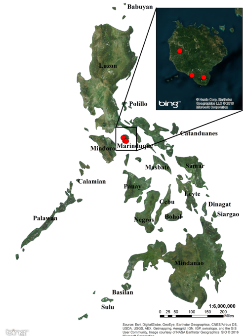
Fig. 3. Distribution of Pachyrhynchus rukmanee sp. n. in Marinduque Isl.