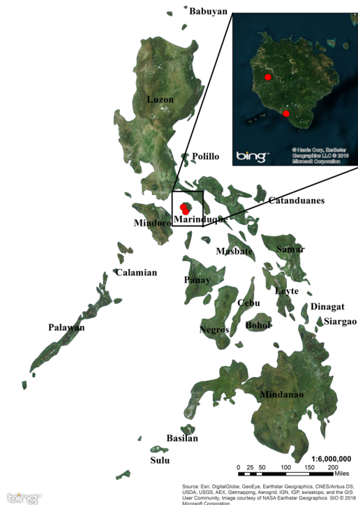
Fig. 5. Distribution of Macrocyrtus rukmanee sp. n. in Marinduque Isl.

Differential diagnosis. Macrocyrtus rukmanee