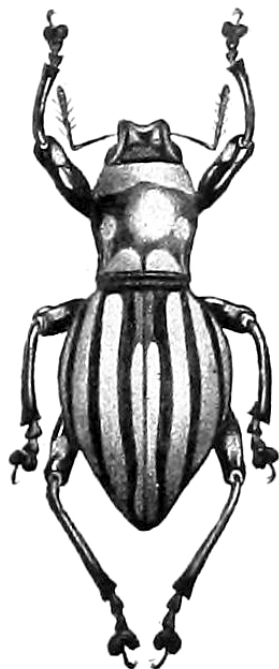
Fig. 2. Pachyrhynchus loheri Schultze, 1917 (Schultze 1917)