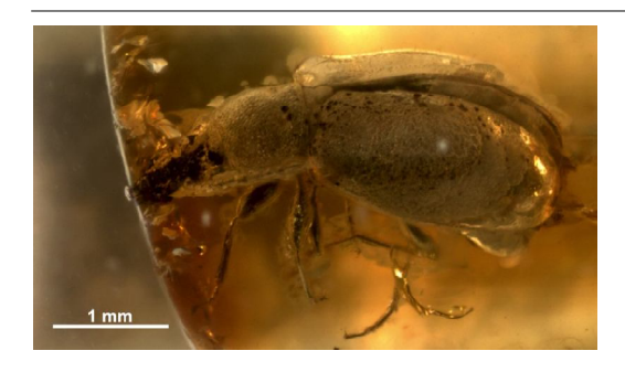
Figure 1. Salpingus henricusmontemini sp.nov. Habitus: dorso-lateral view, left side.