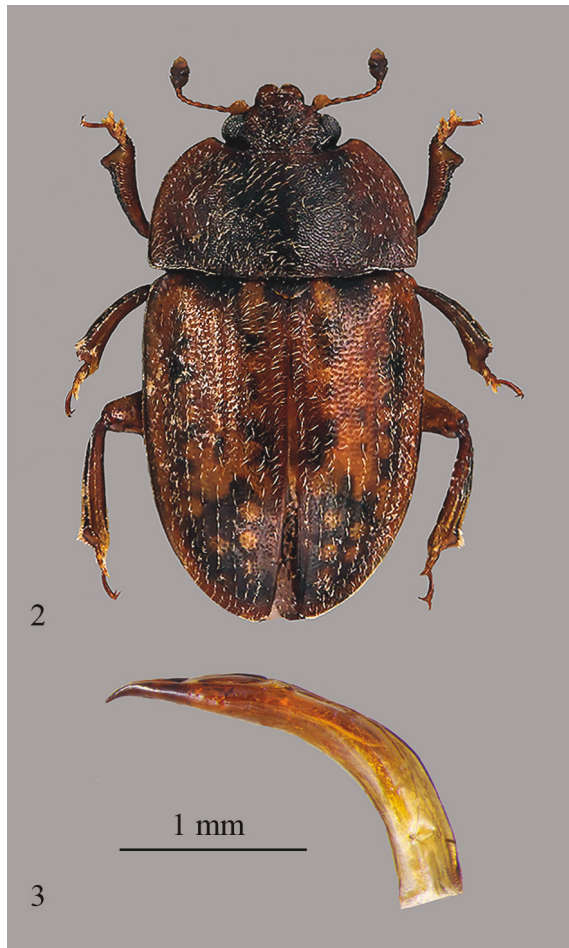
Figures 2, 3. Phenolia ( L. ) picta male from Sicily, length 7.4 mm. (Fig. 2), with aedeagus (Fig. 3).

untia sp.), vine ( Vitis vinifera ), and oranges ( Citrus sp.). These authors observed P. picta and P. tibialis living in different locations and managed to breed them in the laboratory by making further observations on their biology and larval morphology.