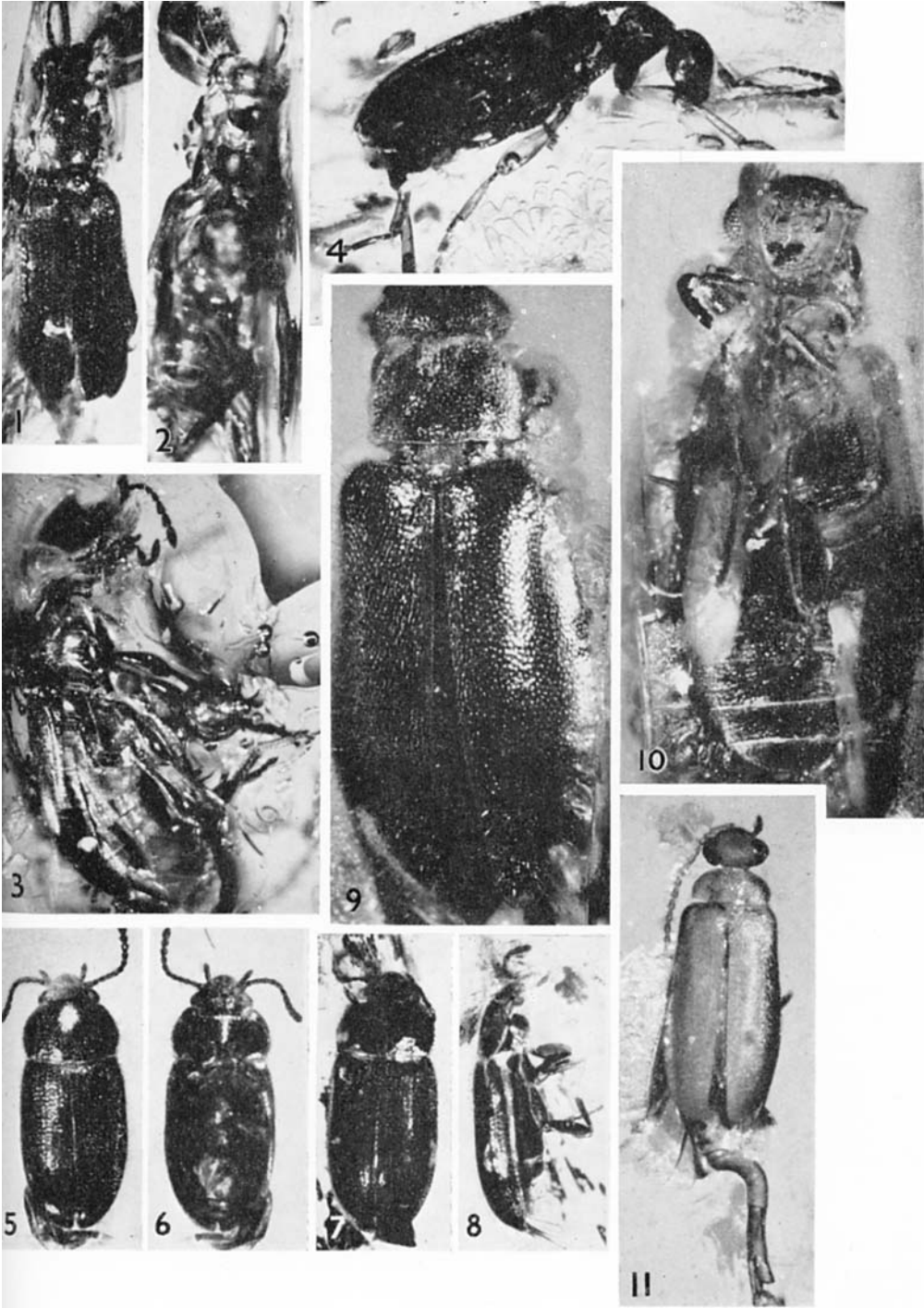
Heteromerous beetles from Baltic amber