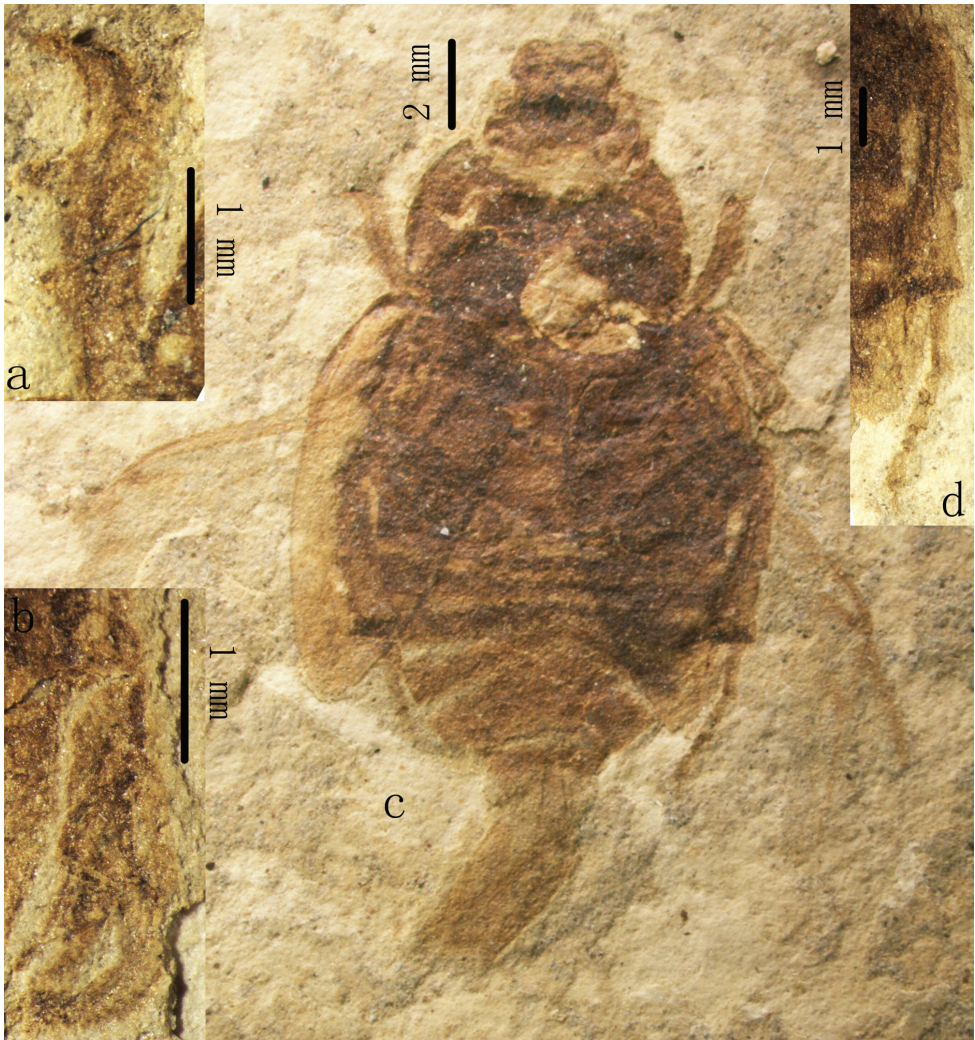
Figure 1. Cretohypna cristata Yan, Nikolajev & Ren gen. et sp. n., holotype, registration No. CNU-COL-NN2011003, a protibia b mesotibia c body in dorsal view d metatibia and metatarsus.

Diagnosis. Large elongate oval and compact (head, pronotum and mesothorax are very close to each other) scarab beetle (Fig. 1c). Mandibles and labrum exposed beyond apex of clypeus and clearly visible in dorsal view of head, labrum approximately five times as wide as long. Pronotum subquadrate shaped with concave anterior margin and slightly convex lateral and posterior margins. Scutellum triangular. Mesoepimeron clearly visible from above between pronotum and elytron. Elytra convex and thin, without longitudinal carina; hind wings well-developed. Legs short and strong, mesocoxae moderately separated, protibia with three large teeth on outer margin (Fig. 1a), apex of male mesotibia lamellate (Fig. 1b, arrow); mesotibia and metatibia with 2 apical spurs; male metatarsus shorter than corresponding tibia (Fig. 1d). Abdomen