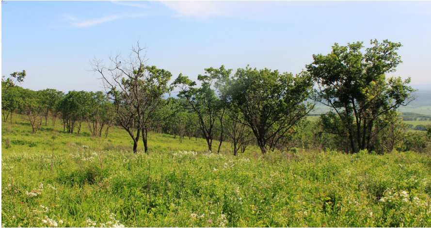
Fig. 4. The sparse oak forest about 46 km NE from Ussuriysk, the natural habitat of Trox mitis in Russia.