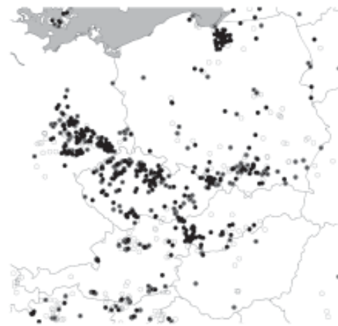
Fig. 6. Distribution of Osmoderma eremita in Eastern Germany, Poland, Czechia, Slovakia, Austria and Hungary: ○. Last record before 1950, or the time unknown; ◉. Last record 1950–1989; ●. Last record in 1990 or later.

pasture landscapes and parks, free-standing trees have become scarcer for several reasons, for instance due to ceased removal of underwood (Vera, 2000). On agricultural fields and in alleys trees have been removed. Besides, a wide relinquishing of old fruit plantations has led to a massive lost of suitable habitats in Western Germany (Stegner, 2002). A problem, which today is mainly "eastern", is the loss of large trees due to the development of housing and trade areas and new highways (Saxony: Lorenz, 2001; Schaffrath, 2003b). For instance, many trees with O. eremita were lost due to the building of an automobile factory in Dresden.