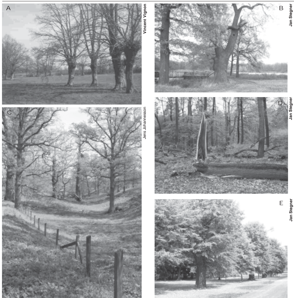
Fig. 1. Typical trees harbouring Osmoderma eremita for different parts of Europe: A. Pollarded oaks in hedgerows in western France; B. Oaks in a historical pond-region in Eastern Germany; C. Pastured oak-land in southern Sweden; D. Beech forest in Germany, the tree harboured O. eremita before it was storm-felled; E. An alley with willow trees in a park in Germany.

Fig. 1. Árboles típicos que cobijan a Osmoderma eremita de distintas partes de Europa: A. Robles desmochados en zonas de setos en el oeste de Francia; B. Robles en una región con charcas de Alemania del Este; C. Tierras de pastoreo con robles en el sur de Suecia; D. Hayedo de Alemania, el árbol cobijaba a O. eremita antes de que fuera cortado por una tormenta; E. Un paseo con sauces en un parque de Alemania.