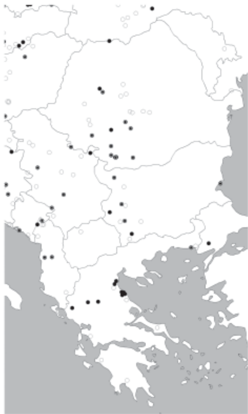
Fig. 5. Distribution of Osmoderma eremita in Serbia, Montenegro, Macedonia, Albania, Greece, Rumania, Moldova and Bulgaria: ○. Last record before 1950, or the time unknown; ◉. Last record 1950–1989; ●. Last record in 1990 or later.

Fig. 5. Distribución de Osmoderma eremita en Serbia, Montenegro, Macedonia, Albania, Grecia, Rumania, Moldavia y Bulgaria: ○. Último registro anterior a 1950, o fecha desconocida; ◉. Último registro entre 1950 y 1989; ●. Último registro de 1990 o posterior.