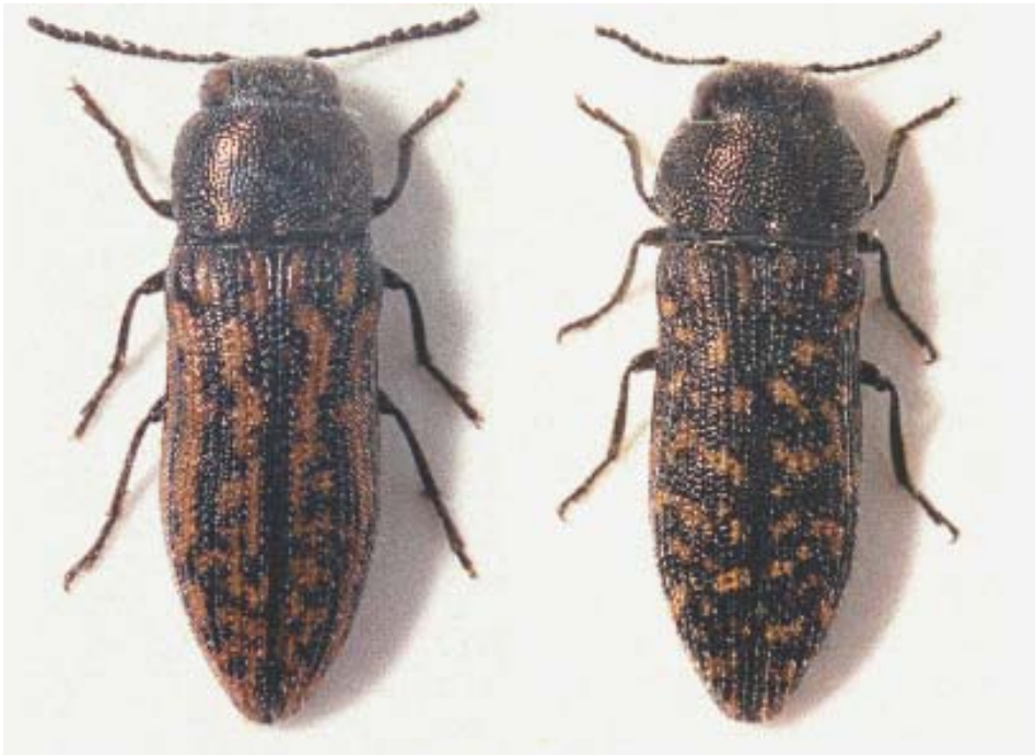
Fig. 1. Acmaeodera (Acmaeotethya) guayarmina sp.n., habitus.