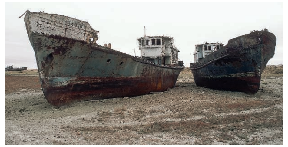
Beached. A Soviet decision to divert river water to cotton farming hastened the Aral Sea's retreat.

As the sea level dropped, the sea's only Barsa Kelmes, became accessible by car in