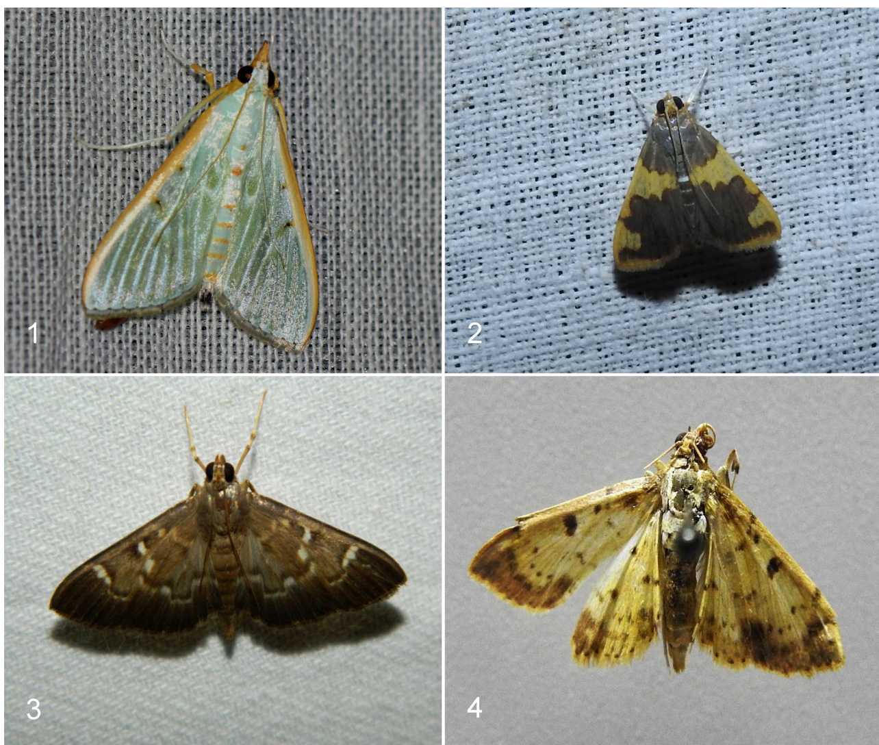
Figs 1–4. Pyraloidea from Andaman and Nicobar Islands. 1, Arthroschista hilaralis (Walker, 1859); 2, Rehimena phrynealis (Walker, 1859); 3, Syllepte iophanes (Meyrick, 1894); 4, Herpetogramma cynaralis (Walker, 1859).

Electronic supplementary material to the article: Rao B.S.K. & Sivaperuman C. 2021. New records of pyraloid moths (Lepidoptera: Pyraloidea) in the Andaman and Nicobar Islands, India. Zoosystematica Rossica , 30 (2): 215–221.