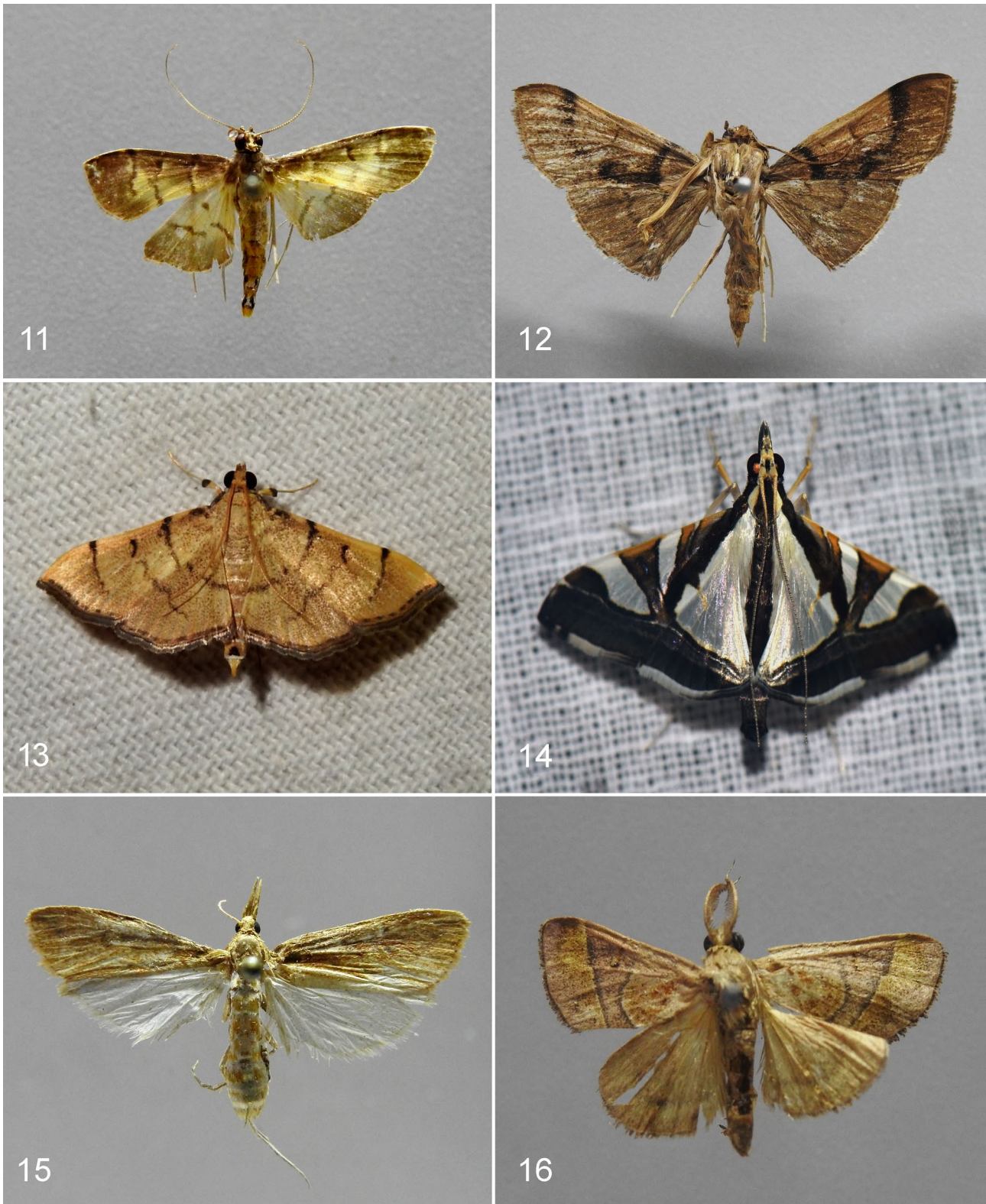
Figs 11–16. Pyraloidea from Andaman and Nicobar Islands. 11, Bacotoma binotalis (Warren, 1896); 12, Omiodes barcalis (Walker, 1859); 13, Omiodes decisalis (Walker, 1866); 14, Agrioglypta excelsalis (Walker, 1866); 15, Donacaula dodatellus (Walker, 1864); 16, Pseudosacada flexuosa (Snellen, 1890).