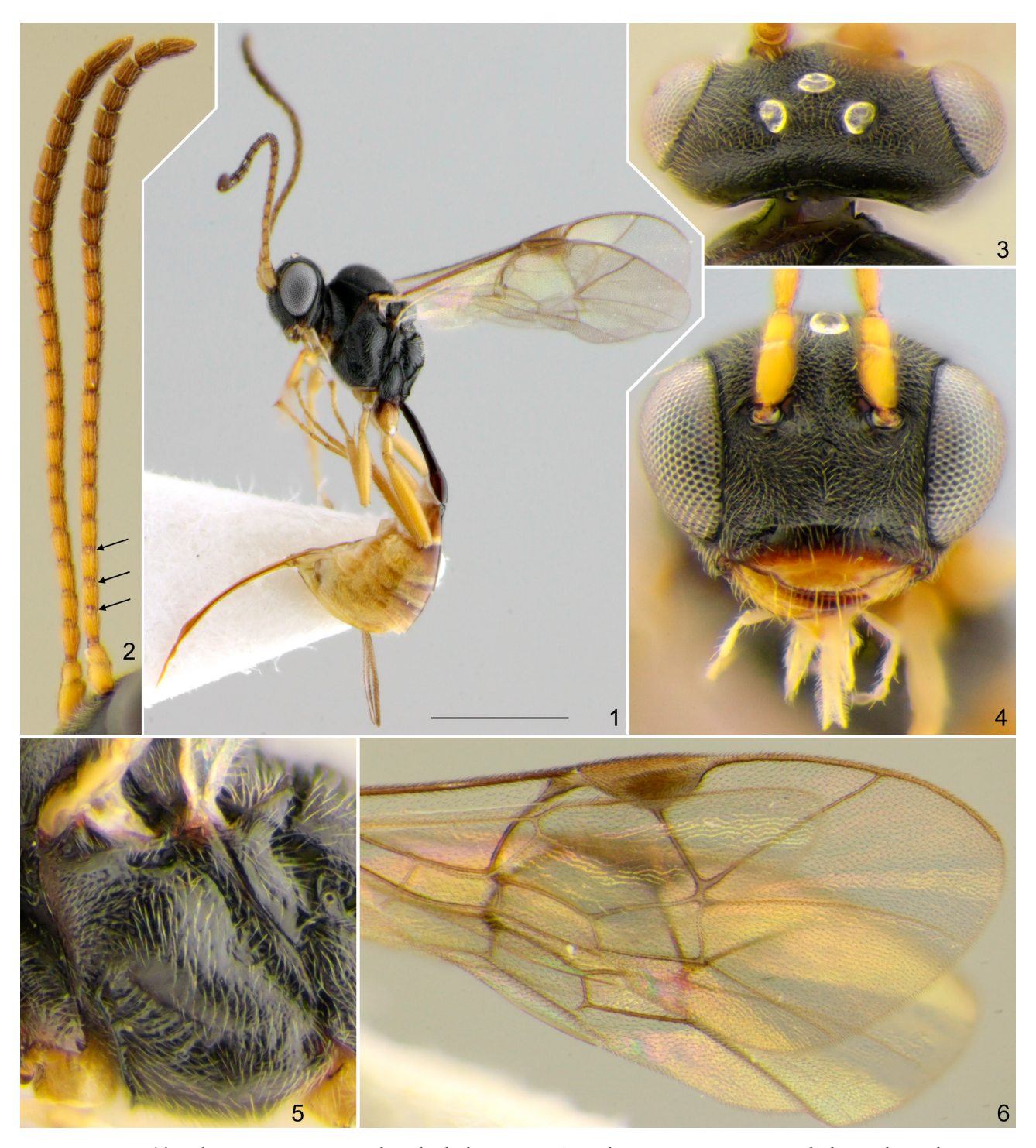
Figs. 1–6. Probles chernetsovi sp. nov., female, holotype (1, 5) and paratype (2–4, 6). 1, habitus, lateral view; 2, antennae, ventrolateral view (finger-shaped structures, arrows); 3, head, dorsal view; 4, head, front view; 5, mesopleuron, lateral view; 6, wings. Scale bar: 1.0 mm.

Fore wing (Figs 6, 10) with second recurrent vein (2m-cu) postfurcal to almost interstitial. Metacarpus (R1) reaching tip of wing. First abscissa of radius (Rs+2r) straight, longer than