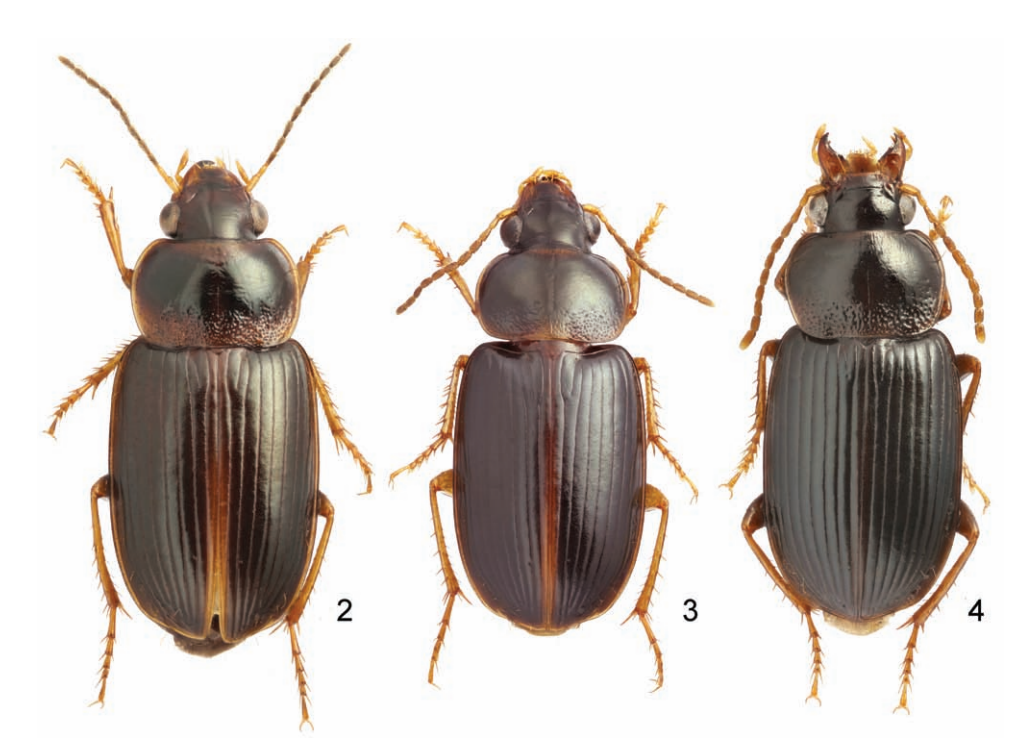
Figs 2–4. Stenolophus (subgenus Egadroma ), general appearance: 2, S . ( E .) ovatulus (Vietnam); 3, S . ( E .) melniki sp. nov. (holotype); 4, S . ( E .) ovchinnikovi sp. nov. (holotype).