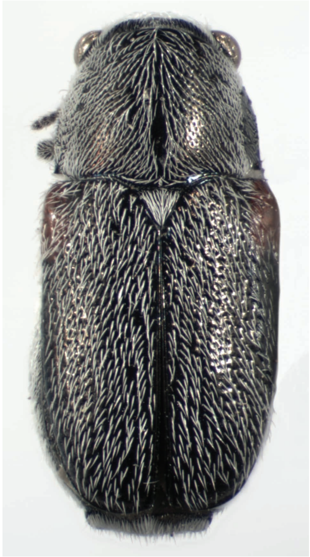
Fig. 2. Coscinoptera tamaulipasi L. Medvedev sp. nov., general view.

Holotype. Mexico, Tamaulipas: Ciudad Victoria, Parque Recreativo Siglo XXI, submoun-