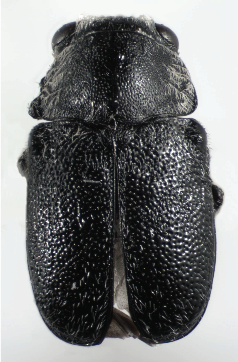
Fig. 1. Coscinoptera victoriana L. Medvedev sp. nov. , general view.

most circular. Antennae reaching middle of prothorax, segments 2 and 3 small, rounded, segment 4 distinctly triangular, segments 5–10 strongly transverse, with elongate processes, each about 1.5 times as wide as long. Prothorax 1.5 times as long as wide, broadest near base, distinctly tapering ante-