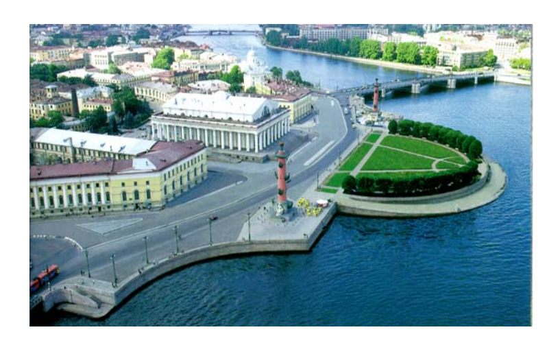
Venue 1 for 11 October, 12 October, 13 October, 14 October and 15 October (Registration, Opening Ceremony, Oral presentations - topics 1, 2, 3, 5 and Closing Ceremony) - the Hall of the Saint Petersburg Scientific Center, Universitetskaya embankment 5, Saint Petersburg Building #1 (on Maps)