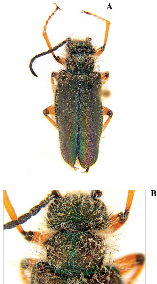
Fig. 1 – Teratolytta capillata sp. n.; male, habitus in dorsal view (A). Pronotum in dorsal view (B).

Description. Body metallic, bronze-cupreous with green vertex, apex and base of pronotum, and green longitudinal stripes at middle of pronotum, next to elytral suture, lateral margin and middle of each elytron; elytral suture blue; maxillary palpi orange-red as well as legs, except coxae, trochanters, apex of femora and base of tibiae, which are black; mouthparts black, antennae subopaque black. Setation white with scattered black setae on fore part of body and last sternite. Total length 12.5–13.3 mm; head maximum width 2.5–2.6 mm; pronotum length 1.7–1.8 mm, pronotum maximal width 2.3–2.4 mm; elytral maximal width 4.1–4.2 mm. Head subtrapezoidal, distinctly wider than long, maximum width at temples; lateral sides of head obliquely narrowed from base to eyes; frons very slightly