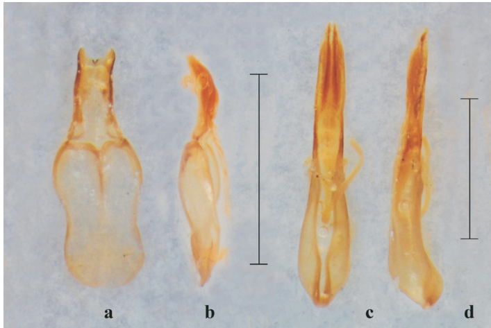
Fig. 18. Zoltanzonitis deserticola , male genitalia: gonoforceps, ventral (a); gonoforceps lateral (b); aedeagus dorsal (c); aedeagus, lateral (d). Bar: 1 mm.

from a doubtful southern African locality (Péringuey 1886; see also 1892, 1909) and never again recorded as such, except recently from Namibia (Bologna et al. 2018). The var. surcoufi (sub elongaticeps ) was described from Mozambique (Pic 1935). We examined the photo of the holotype of Zonitis natala from 'Natal' (= KwaZulu-Natal,