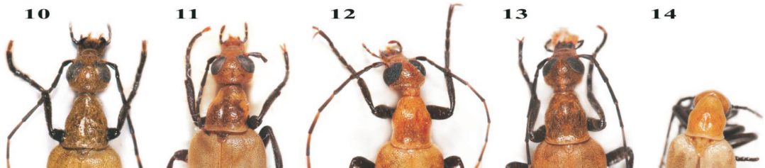
Figs 10–14. Zoltanzonitis testaceiventris , variation of colour: Kenya, Voi (10, 11); South Africa, Mpumalanga, Kruger N.P., Skukuza (12); South Africa, Southpansberg, Sard (13); South Africa, Limpopo, Merensky (14).

medially (this feature also occurs in some central African populations) (Fig. 8) and the genae are black or deeply infuscate rather than yellow or only slightly infuscate as in other populations. No additional information on natala , posticalis , burgeoni and elongaticeps var. surcoufi , was published after their descriptions.