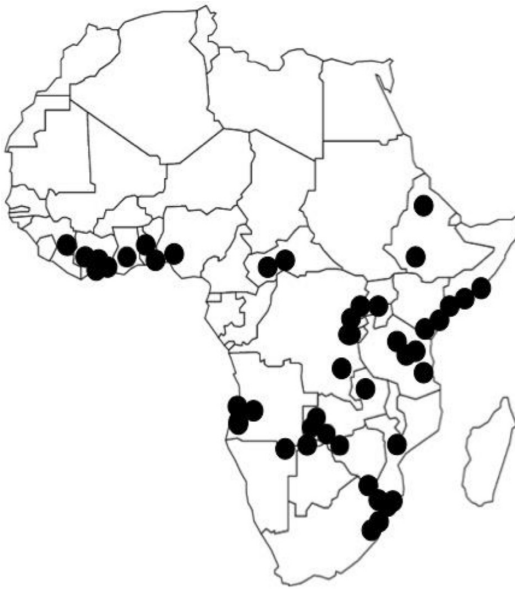
Fig. 20. Distribution of Zoltanzonitis natala .

var. brunneicollis as synonyms ( syn. n. ) of Zoltanzonitis testaceiventris (Pic, 1931a) ( comb. n. ). No additional data for jansei and elongaticeps were published after their descriptions. For testaceiventris there is a single somewhat uncertain record from northeastern Namibia (Bologna et al. 2018) and another of the var. brunneicollis from Tanzania (Pic 1939).