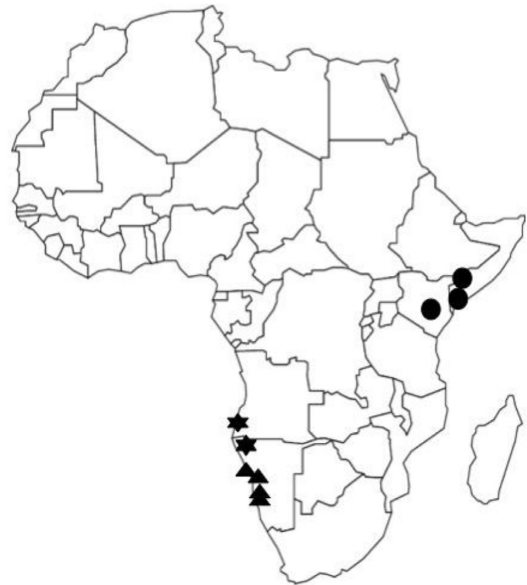
Fig. 22. Distribution of Zoltanzonitis bivittipennis (★), Z. deserticola (▲), Z. griseohirta . (●).

(Fig. 4) are quite similar to testaceiventris , with the former easily recognised by its partially red legs and the second by the carmine colouration and the considerably less dense punctation on the pronotum. Zoltanzonitis griseohirta was described from Somalia and later erroneously recorded from the Arabian Peninsula and several Afrotropical coun-