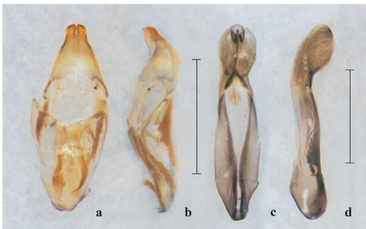
Fig. 17. Zoltanzonitis griseohirta , male genitalia: gonoforceps, ventral (a); gonoforceps lateral (b); aedeagus dorsal (c); aedeagus, lateral (d). Bar: 1 mm.