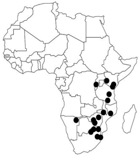
Fig. 21. Distribution of Zoltanzonitis testaceiventris .

Zoltanzonitis griseohirta (Pic, 1914) ( comb. n. ) (Fig. 3) and Zoltanzonitis deserticola ( comb. n. )