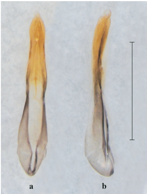
Fig. 19. Zoltanzonitis bivittipennis , male genitalia: aedeagus dorsal (a); aedeagus, lateral (b). Bar: 1 mm.

(ii) Three other nominal taxa [ elongaticeps , jansei , testaceiventris and one variety of testaceiventris (var. brunneicollis )] are characterised by colour. The antennae and legs are completely black, the last six antennomeres reddish, and the venter black except for the last three abdominal ventrites which are red. The structure of the male genitalia is similar and distinctive in that the aedeagus has paired spinose areas dorsoapically and a sclerotised ventrally directed endophallic hook. In addition the gonocoxal plate is elongate and partially membranous at the basal third, dividing the structure into distinct portions. We are unable to find any constant differences between elongaticeps and testaceiventris , in which the shape and punctuation of the pronotum are only slightly variable (Figs 10–13), while only minor differences occur in jansei . In the latter the elytra are distinctly light yellow (Fig. 14) rather than deep yellow or yellow brown as in the other forms (Figs 10–13) and the elytral punctures are slightly more distanced. It represents a southern geographic colour variant which occurs intermixed with typical populations in Kenya and Mozambique. Pic (1939) described testaceiventris var. brunneicollis , a minor colour variant with a darker head and pronotum; material from Mozambique and Zimbabwe of this form was examined. Considering this minor variation we treat elongaticeps , jansei and testaceiventris