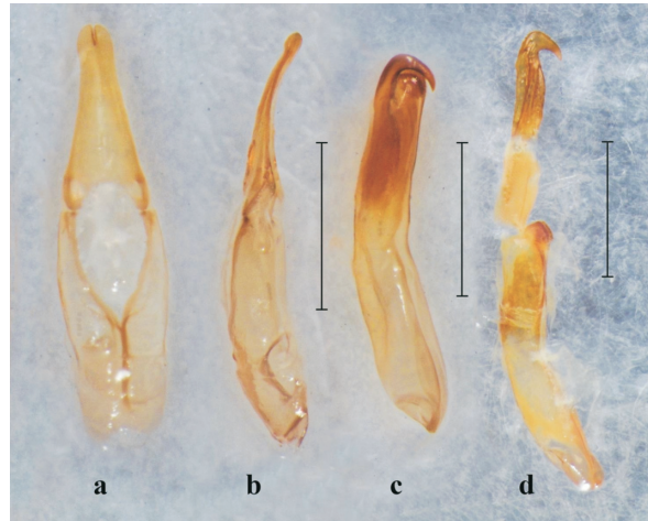
Fig. 15. Zoltanzonitis natala , male genitalia: gonoforceps, ventral (a); gonoforceps, lateral (b); aedeagus lateral (c); aedeagus with everted endophallic hook, lateral (d). Bar: 1 mm.