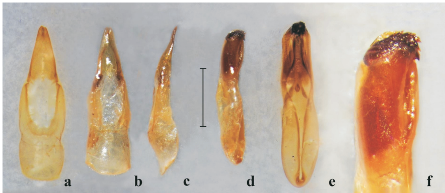
Fig. 16. Zoltanzonitis testaceiventris , male genitalia: gonoforceps, ventral (a); gonoforceps, dorsal (b); gonoforceps, lateral (c); aedeagus, lateral (d); aedeagus, dorsal (e); detail of aedeagal apex, lateral (f). Bar: 1 mm.