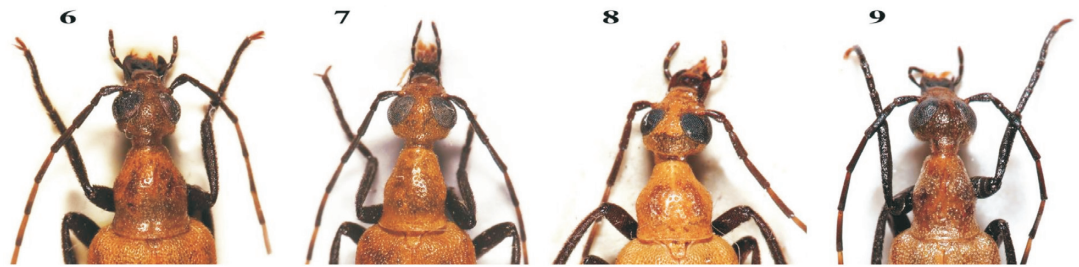
Figs 6–9. Zoltanzonitis natala , variation of pronotum and head punctation: South Africa, KwaZulu-Natal, Mkuze River (6); Tanzania, Same (7); Zaire, Ishango, Virunga N.P. (8); Kenya, Voi (9).