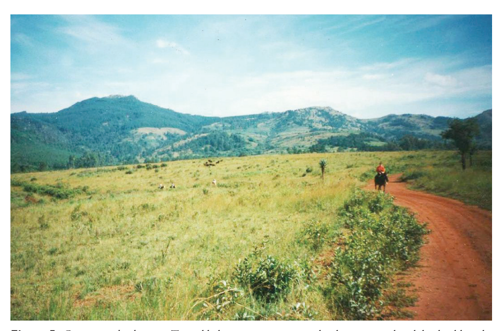
Figure 5. Gyronotus schuelei sp. n. Typical habitat in montane grassland interspersed with bushveld pockets (Mlilwane Nature Reserve, Swaziland).