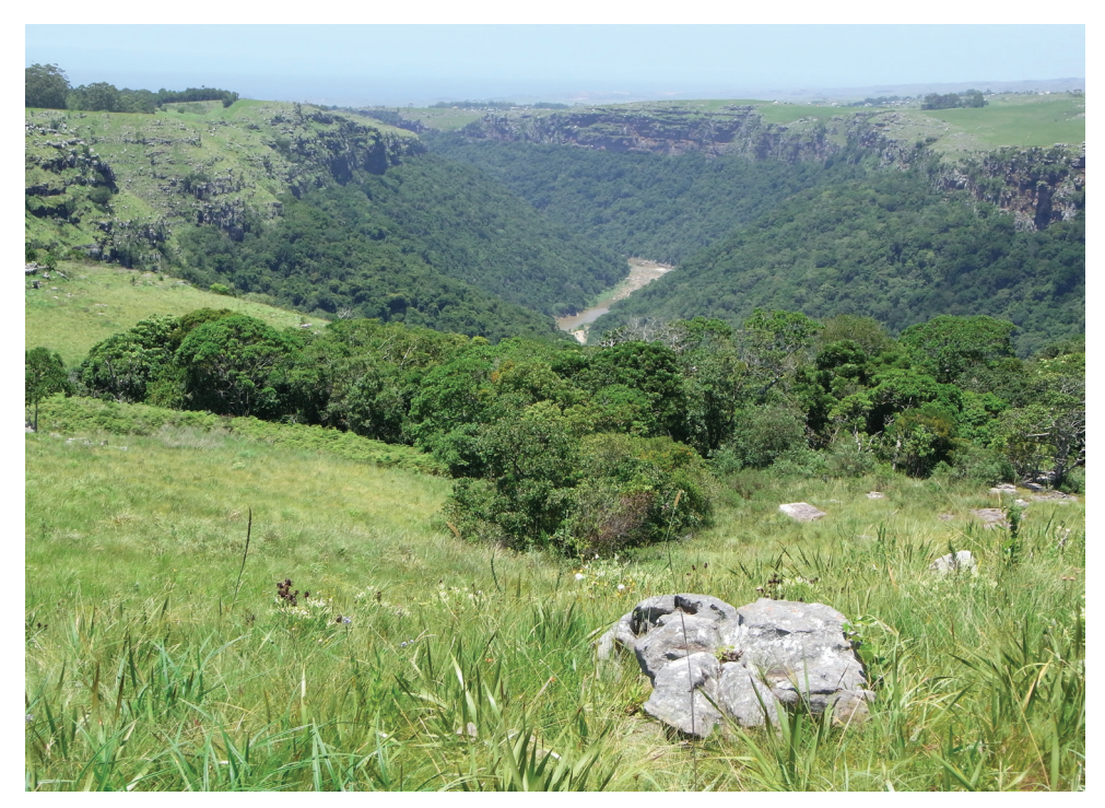
Figure 4. Gyronotus perissinottoi sp. n. Typical habitat in the escarpment grassland at the margin of the riverine forest (Umthamvuna Nature Reserve, South Africa).