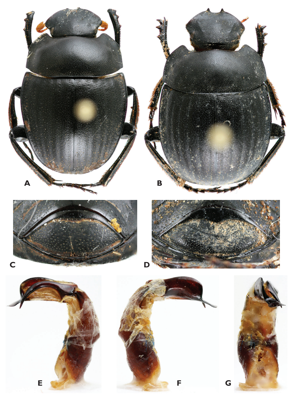
Figure 2. Gyronotus schuelei sp. n. A Holotype male, dorsal habitus B Allotype female, dorsal habitus C Male pygidium, ventral side D Female pygidium, ventral side E left F right and G ventral sides of aedeagus.