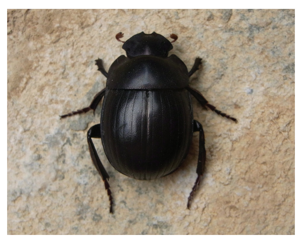
Figure 3. Gyronotus perissinottoi sp. n. in its natural habitat at the Umthamvuna Nature Reserve.

Head. Entirely, densely and finely punctate except for a small space between the clypeal teeth, which is finely dotted.