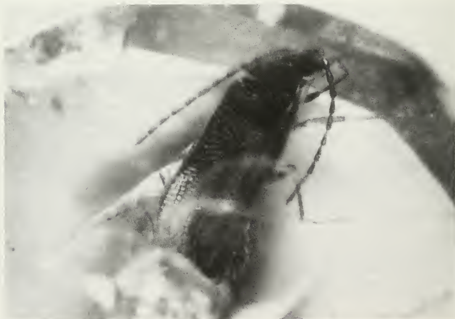
Fig. 1: Berendtimirus progenitor gen. n., sp. n. Holotype, dorsal view. Black rest.