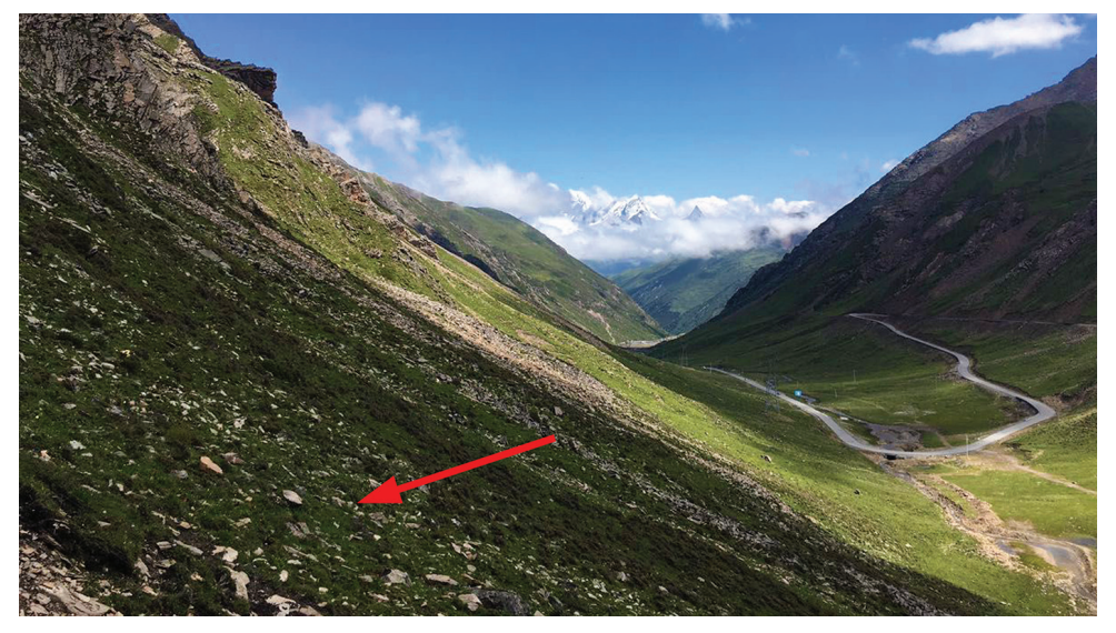
Figure 3. Habitat of Micropeplus liweiae sp. n. The new species was collected under a rock (red arrow) in an alpine meadow of Xiaojin, Sichuan.