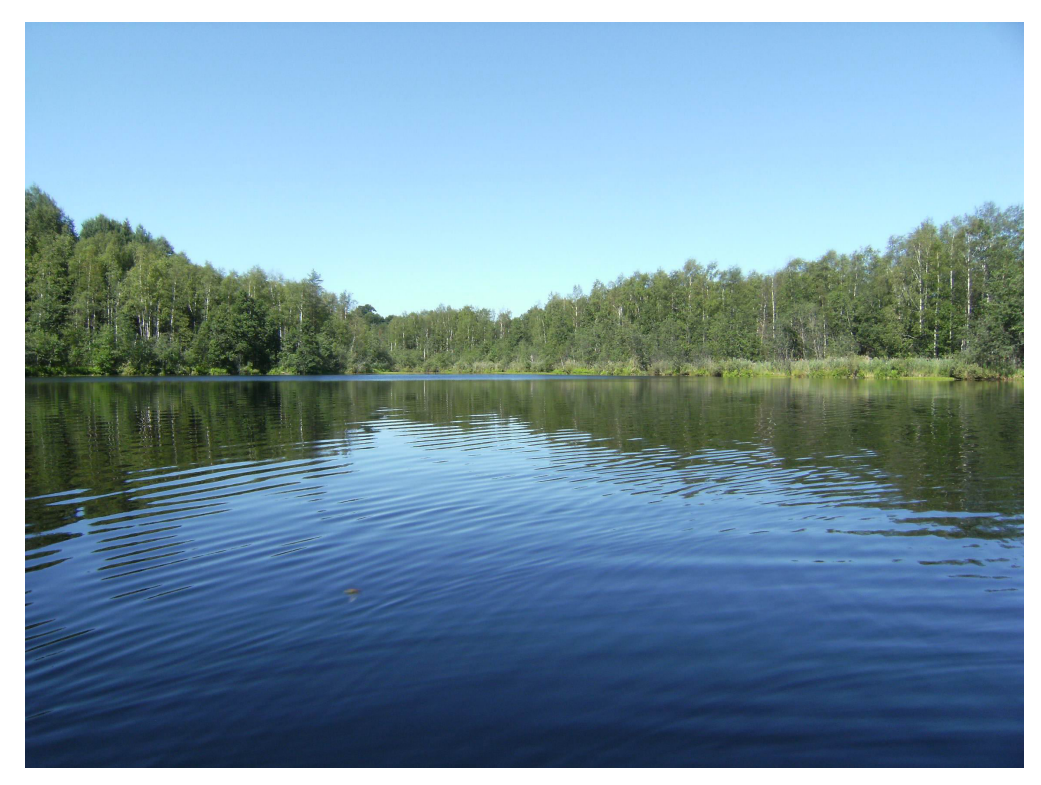
Figure 1. Lake Glukhoye in Tver Oblast, European Russia, used as a model waterbody for studying funnel trap efficiency, photographed in July 2010.

volume was filled with water and the rest of the volume (close to the bottom) was filled with air and protruded above the surface. We put 10 g of meat fibres (without fat) of tinned Glavprodukt stewed beef (GOST 5284-84) in one bottle in each pair and 10 g of frozen liver in the other. Each portion of bait was weighed using electronic scales.