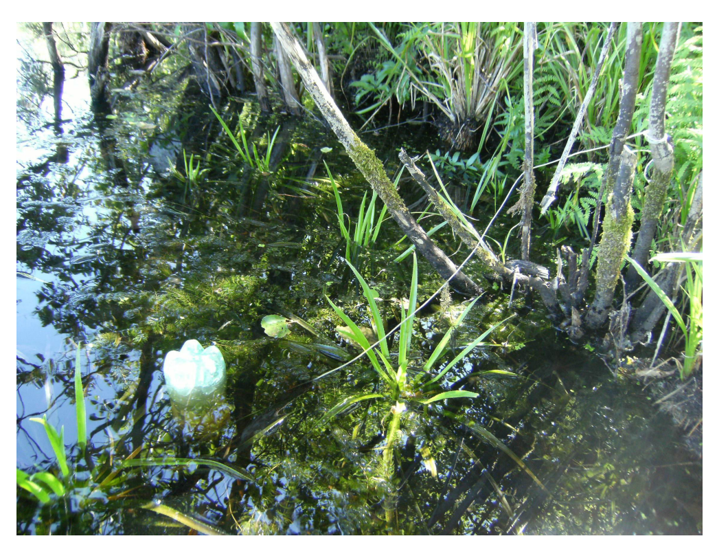
Figure 2. Funnel trap set near lake bank and fastened to a shrub by cord (Lake Glukhoye, July 2010).

Comparison of the efficiency of different quantities of bait