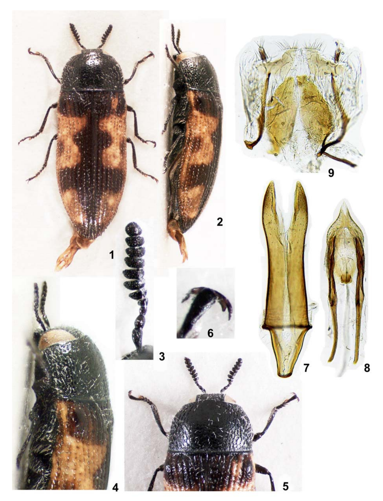
Fig. 1–9. Xantheremia (s.str.) niehuisi sp. n. 1–6 – holotype (ZIN), male (body length 4.8 mm); 7, 8 – paratype (ZIN), male; 8 – paratype (ZIN), female: 1, 2, 4, 5 – habitus, 1, 5 – dorsal view, 2, 4 – lateral view; 3 – antenna (left); 6 – tarsomere 1, claws; 7, 8 – aedeagus: 7 – tegmen, 8 – penis; 9 – ovipositor.

Fig. 1–9. Xantheremia (s.str.) пієћиізі sp. n. 1–6 – голотип (ZIN), самец (длина тела 4.8 мм); 7, 8 – паратип (ZIN), самец; 8 – паратип (ZIN), самка: 1, 2, 4, 5 – габитус, 1, 5 – вид сверху, 2, 4 – вид сбоку; 3 – антенна (левая); 6 – передняя лапка, коготки; 7, 8 – эдеагус: 7 – тегмен, 8 – пенис; 9 – яйцеклад.