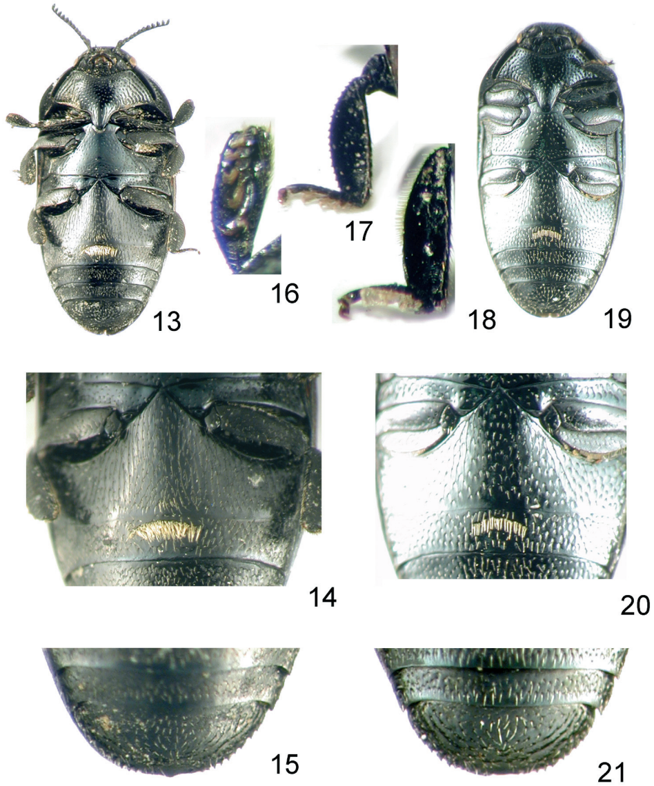
Figs. 13-21. 13-18: Galbella (Galbella) holzschuhi sp. nov., paratype ♀, 5.1 mm. 13 – ventral view; 14 – abdominal sternites 1-2; 15 – abdominal sternites 4-5; 16 – fore leg; 17 – middle leg; 18 – hind leg. 19-21: G. (G.) felix (Marseul), ♀, 4.7 mm. 19 – ventral view; 20 – abdominal sternites 1-2; 21 – abdominal sternites 4-5.