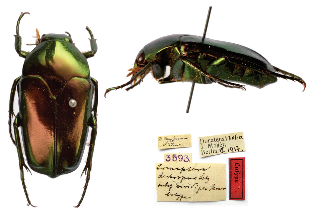
Figure 13. Lomaptera dichropus viridipes Moser, 1908, syntype. a dorsal view b lateral view c labels.

Remarks. The species was described from an unknown number of specimens measuring from 21 to 25 mm. The type locality "Huon-Golf" (currently, Huon Gulf) is the large gulf in eastern Papua New Guinea belonging to Marobe Province. However, Sialum (at one time, Helena-Hafen) is located at north of the Huon peninsula, beyond that gulf.