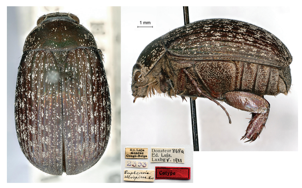
Figure 4. Euphoresia alboparsa Moser, 1913, syntype. a dorsal view b lateral view c labels.