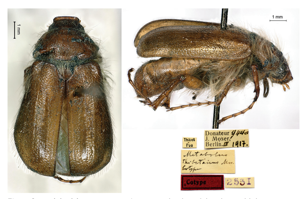
Figure 2. Metabolus thibetanus Moser, 1914, syntype. a dorsal view b lateral view c labels.