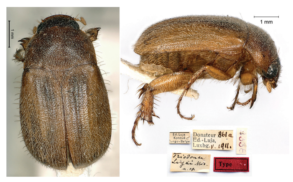
Figure 7. Triodonta lujai Moser, 1917, holotype. a dorsal view b lateral view c labels.