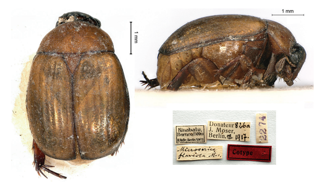
Figure 6. Microserica flaveola Moser, 1911, syntype. a dorsal view b lateral view c labels.

which Moser had purchased from the well-known German dealer Franz Hermann Rolle (1864–1929), were possibly collected by Fruhstorfer, who explored Mount Kinabalu in 1899.