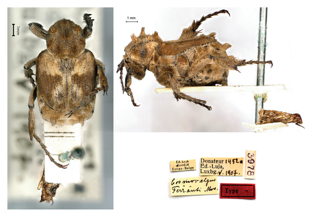
Figure 14. Cosmovalgus ferranti Moser, 1912, holotype. a dorsal view b lateral view c labels.

Remarks. Though two males of the collection carry the label of type, the species was described from only one male ("Der vorliegende \circlearrowleft ist...") measuring 10 mm in body length. Luja collected these specimens during his second mission in Kondué. As for Euphoresia alboparsa and Amaurina vittipennis , both specimens preserved in the MNHNL do not show the wording "type", but considering that Moser did not use standardised labels, the one bearing Moser's label should be deemed as the holotype.