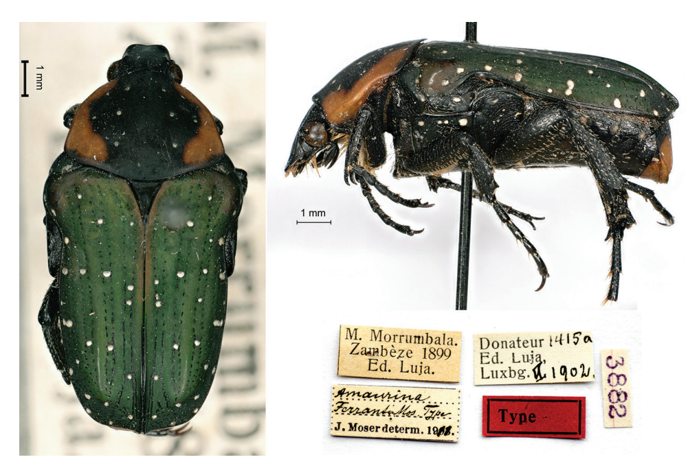
Figure 10. Amaurina ferranti Moser, 1911, holotype. a dorsal view b lateral view c labels.