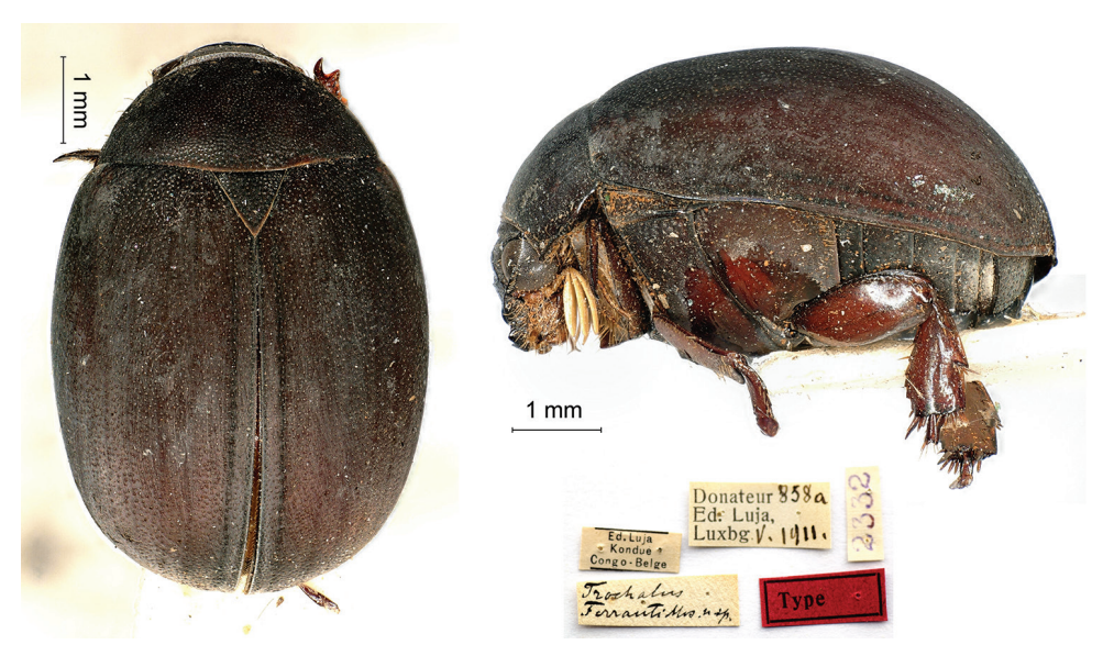
Figure 8. Trochalus ferranti Moser, 1917, syntype. a dorsal view b lateral view c labels.