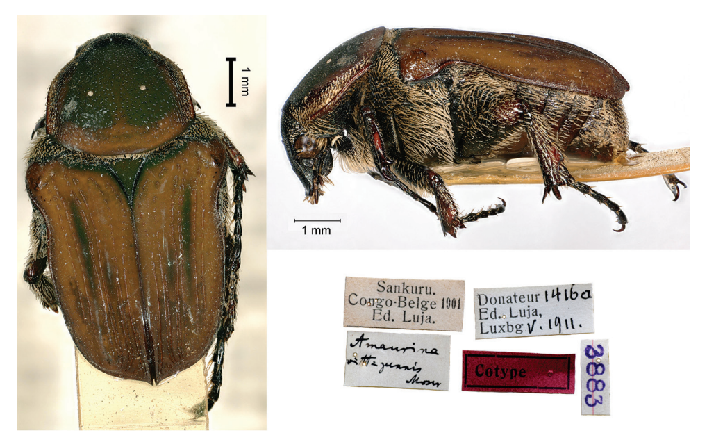
Figure 11. Amaurina vittipennis Moser, 1909, syntype. a dorsal view b lateral view c labels.

As for Euphoresia alboparsa , the specimen preserved in the MHNL does not show the wording "type" as some of Moser's other types, but it should be deemed to be a syntype.