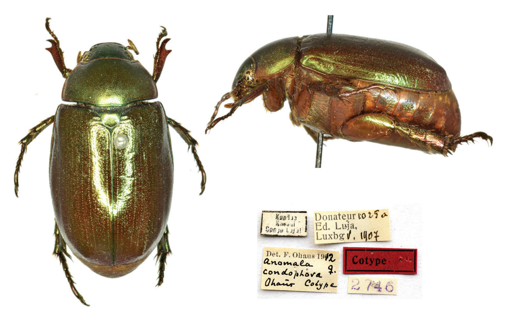
Figure 9. Anomala condophora Ohaus, 1913, syntype. a dorsal view b lateral view c labels.