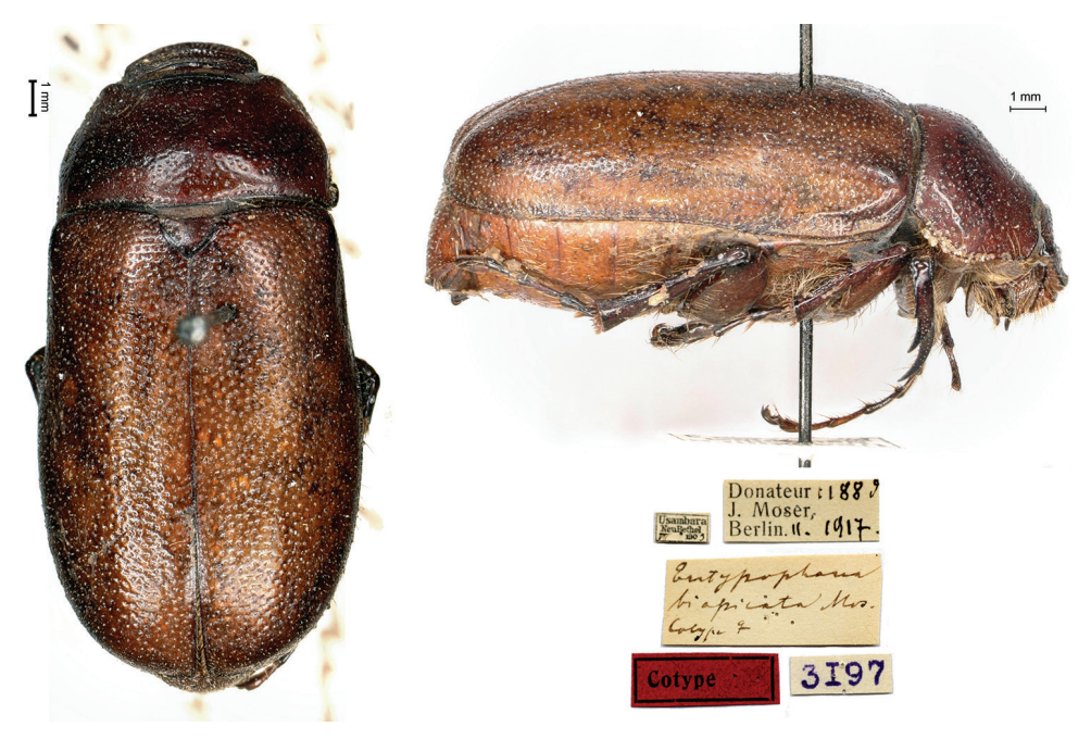
Figure 1. Entypophana biapicata Moser, 1913, syntype. a dorsal view b lateral view c labels.