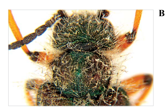
Fig. 1 – Teratolytta capillata sp. n.; male, habitus in dorsal view (A). Pronotum in dorsal view (B).

depressed at middle; mandibles short, robust and curved; clypeus convex; fore margin of labrum slightly emarginate; maxillary and labial palpomeres slender; last maxillary palpomeres 1.25 times as long as penultimate; antennae (Fig. 2C) extending to the basal third of elytra; antennomere I about twice as long as II, III shorter than I and II together; III subequal to IV; III-X elongate, cylindrical; XI 1.6 times as long as X, cylindrical, narrowing in apical third; antennomeres I and II with long black setae. Pronotum (Fig. 1B) subpentagonal, maximal width anterior to middle, wider than long, transversally depressed along the base, pronotal punctures shallow and very scattered. Scutellum relatively wide, subquadrate, with round and slightly depressed apex. Elytra rugose, relatively flattened, without clear tracks of venation, setation uniformly distributed, at basal third bicolour (white and black), and longer than on middle and apex of elytra. Metathorax without tubercles. Tibiae of all legs with two apical spurs, both pointed and slender on pro- and mesotibiae (Figs 2D-E); spurs of metatibiae robust, inner pointed, outer spoon-like