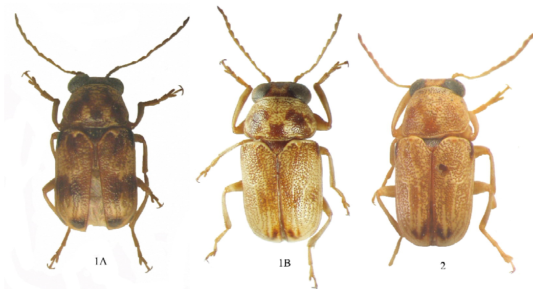
Figs. 1–2. Habitus, dorsal: 1 – Acolastus klimenkoi Romantsov et Bukejs sp. nov.: 1A – holotype, 1B – paratype (prov. Fars), 2 – A. zarudnyi (Jacobson, 1917), lectotype.

Aedeagus (Figs. 3, 15). Lamella, i. e. ventral prolongation of aedeagus elongate, narrow (narrower than base), feebly constricted in the middle; apex angularly-rounded with wide