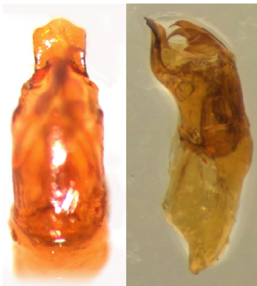
Fig. 3. Acolastus klimenkoi Romantsov et Bukejs sp. nov.: aedeagus, dorsal and lateral.

In ZIN collection, eight specimens (4 males and 4 females) of this this type series with labels specified in original description are found: 1 female from Sargar, 4 females and 1 male from Bampur, 1 male from Ge, 1 male from Bagu. The type series was studied by authors. In one male from Bampur shape of aedeagus is identical with Acolastus