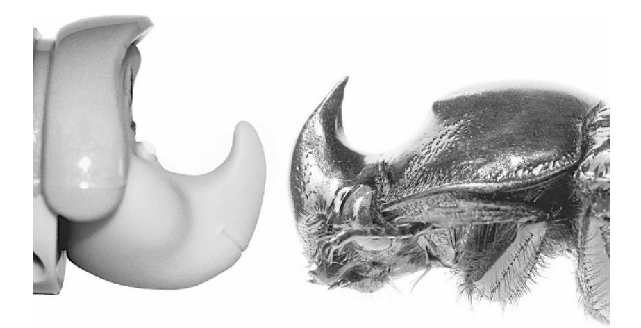
Fig. 11. Lateral view of head of Dim and M. saltini showing similarity in horn configuration ("the Dim Effect"). Dim character <sup>©</sup> Disney Enterprises, Inc. and Pixar. Used by permission from Disney Enterprises, Inc.

Pygidium : Surface weakly aciculate, minutely alutaceous. Base with transverse row of large, moderately dense, setigerous punctures; setae long, reddish brown. In lateral view, surface strongly convex in basal fourth, nearly flat elsewhere (Fig. 5). Legs : Protibia tridentate, teeth subequally spaced. Meso- and metatibia each with 2 transversely oblique carinae. Metatibia at apex with large, narrowly rounded lobe. Venter : Prosternal process long, subconical. Pro-, meso-, and metasternum with long, reddish brown setae. Metasternum either side of middle nearly completely punctate; punctures dense, small; metasternum at center impunctate. Parameres : Figs. 7–8.