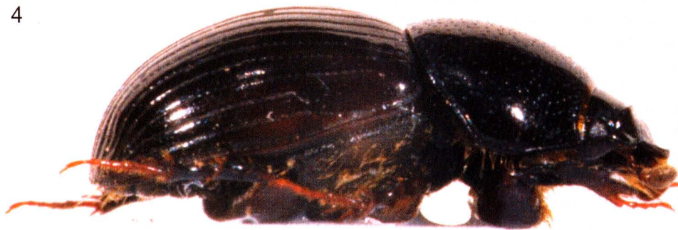
Figs 3-4. Habitus, lateral aspect: 3- A. (L.) mirificus Balthasar (holotype; 6.2 mm); 4- A. (L.) drumonti sp. nov. (holotype; 6.0 mm).