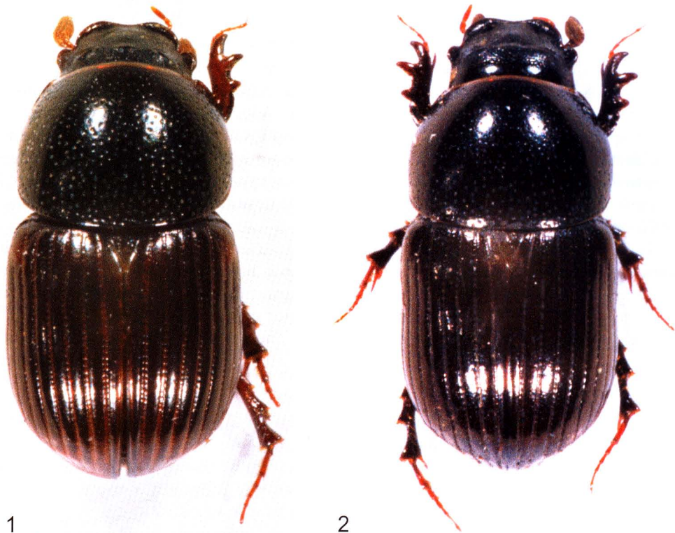
Figs 1-2. Habitus, dorsal aspect: 1- A. (L.) mirificus Balthasar (holotype; 6.2 mm); 2- A. (L.) drumonti sp. nov. (holotype; 6.0 mm).