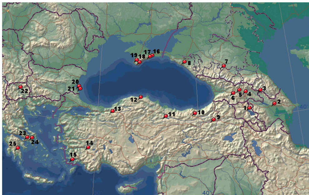
Fig. 14. The area of the taxons of “ P. caucasicus -group”: 1-15 - P. caucasicus caucasicus ; 16-19 - P. caucasicus baeckmanni ssp. n.; 20-22 - P. renyvoniae ; 23-25 - P. graecus . Armenia: 1 - Sevan-city (type locality of P. caucasicus ); Azerbaijan: 2 - Agdash; Georgia: 3 - Lagodekhi, 4 - Mtzheta; 5 - Gori; 6 - Tzagveri; Russia: 7 - Kislovodsk, 8 - Dzhubga Mt.; Turkey: 9 - Erzerum, 10 - Gümüşhane, 11 - Tokat, 12 - S Yaraligoz, 13 - Abant, Bolu, 14 - Denizli, 15 - Mugla; Ukraine, Crimea: 16 - Karadag Mt. (type locality of P. c. baeckmanni ssp. n.) and Koktebel, 17 - Sudak, 18 - Nizhnij Kastropol, 19 - Sevastopol; Bulgaria: 20 - Primorsko, 21 - Ropotamo (type locality of P. renyvoniae ); Macedonia: 22 - Titov Veles; Greece: 23 - Gerania Mts near Lutrakion (type locality of P. graecus ), 24 - Athens, 25 - Taygetos Mts near Trypi.

Remark. Possibly all taxa of P. caucasicus -group of species are in same relations: all can be regarded as subspecies including P. caucasicus graecus Sláma, 1993 (described from South Greece; type locality - Gerania Mts. near Lutrakion; Fig. 14: 20-22) and P. caucasicus renyvoniae Sláma, 2001 (described from Bulgaria and Macedonia; type locality - Ropotamo; Fig. 14: 23-25). In fact several small differences (if they really exist) used for the descriptions of P. graecus and P. renyvoniae are the evidence of more or less strong geographical isolation of certain groups of relative populations (which could be the pretext for the description of subspecies, but not the evidence of the species status).