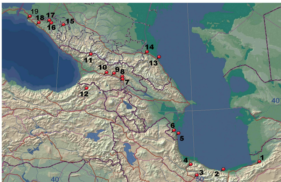
Fig. 13. The area of Purpuricenus kaehleri menetriesi : 1-4 - Iran; 5-6 - Azerbaijan; 7-11 - Georgia; 12 - Turkey; 13-18 Russia. Iran: 1 - Gorgan (Astrabad), 2 - Mazandaran prov., 40km E Chalus, 3 - Kazvin (about 150km NW Tegeran), 4 - Gilan prov., 10km E Tutkabon, E Rostam Abad; Azerbaijan: 5 - Talysh, Avrora (or Alekseevka), 6 - Talysh, Nyuvady; Georgia: 7 - Tbilisi, 8 - Mtzheta, 9 - Gori, 10 - Surami, 11 - Svanetia; Turkey: 12 - Ardanush, about 20km E Artvin; Russia: 13 - Dagestan, Talgi, 14 - Dagestan, Khasavjurt, 15 - Adygeja, Maikop, 16 - Krasnodar region, Goriachij Kliuch, 17 - Krasnodar region, Kaluzhskaja, 18 - Krasnodar region, Anapa, 19 - Gelendzhik.

Distribution. (Fig. 14: 16-19). South of Crimean Peninsula, Ukraine. Known localities are: Mt. Karadag (near Koktebel) - type locality, (ZMM); Koktebel, (ZMM); Sudak, (ZIN); Nizhnij Kastropol (between Baidary and Simeiz), (ZIN); Sevastopol env., (AM).