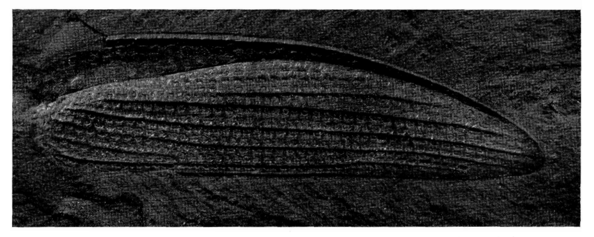
Figure 2. Labradorocoleus carpenteri, gen. nov., sp. nov. Photograph of holotype, Princeton University Paleontological Collections. Length of elytron, 7 mm.