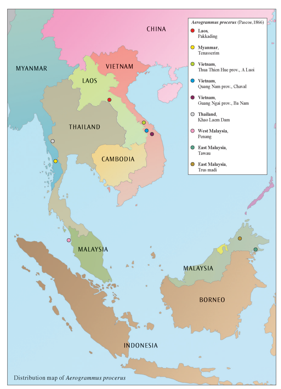
Figure 3. Distribution map for A. procerus in South-Eastern Asia (map realized by J.-P. Saltin).